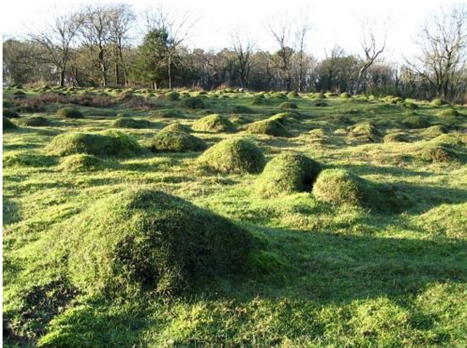
Unimproved limestone grassland with anthills

An outstanding number and mix of priority habitats create a mosaic which is home to an amazing diversity of wildlife. The variety and importance of the wildlife in relation to the small size of the area is a unique quality of this AONB. Historically, the limestone geology was gradually overlain by acid, neutral and alkali soils of varying character. This unusual and varied range of soil conditions together with the area's geographical position, varying climatic influences and different kinds of human management has enabled the different habitat types to develop.