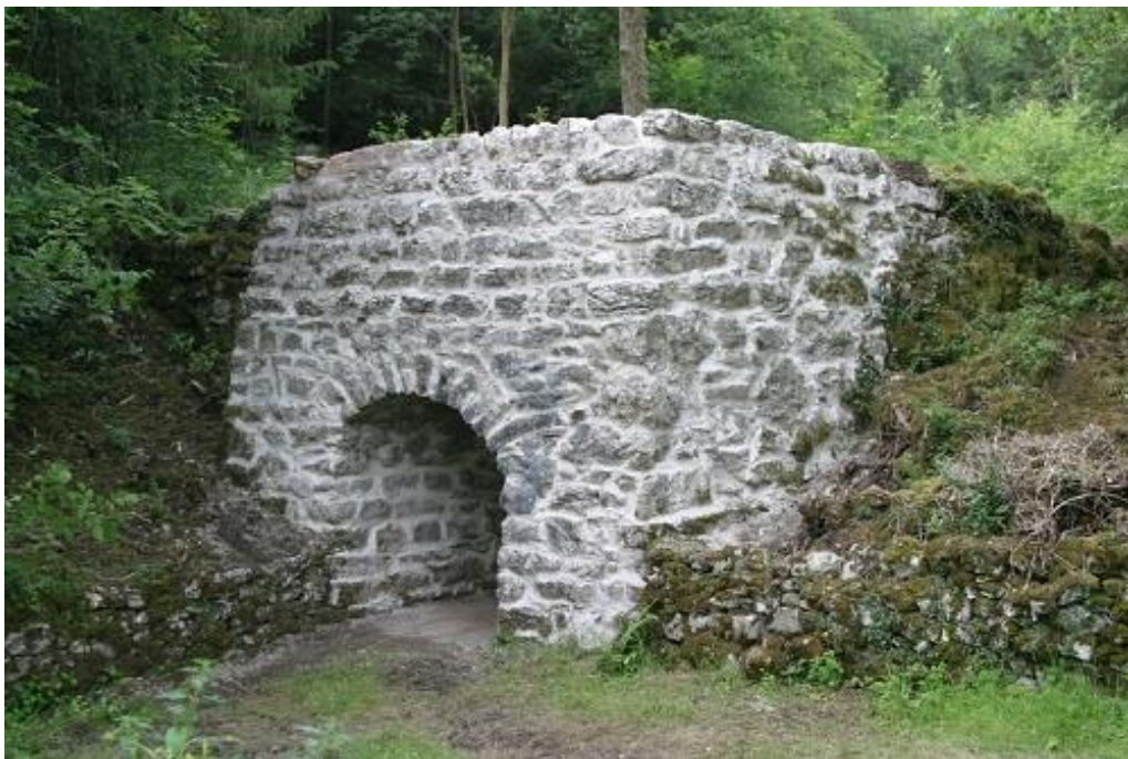
Waterslack limekiln

Local Heritage Lists are currently being developed by the local authorities within the AONB, which will identify features of local historic or architectural interest and which also make a positive contribution to the unique historic character of the area.