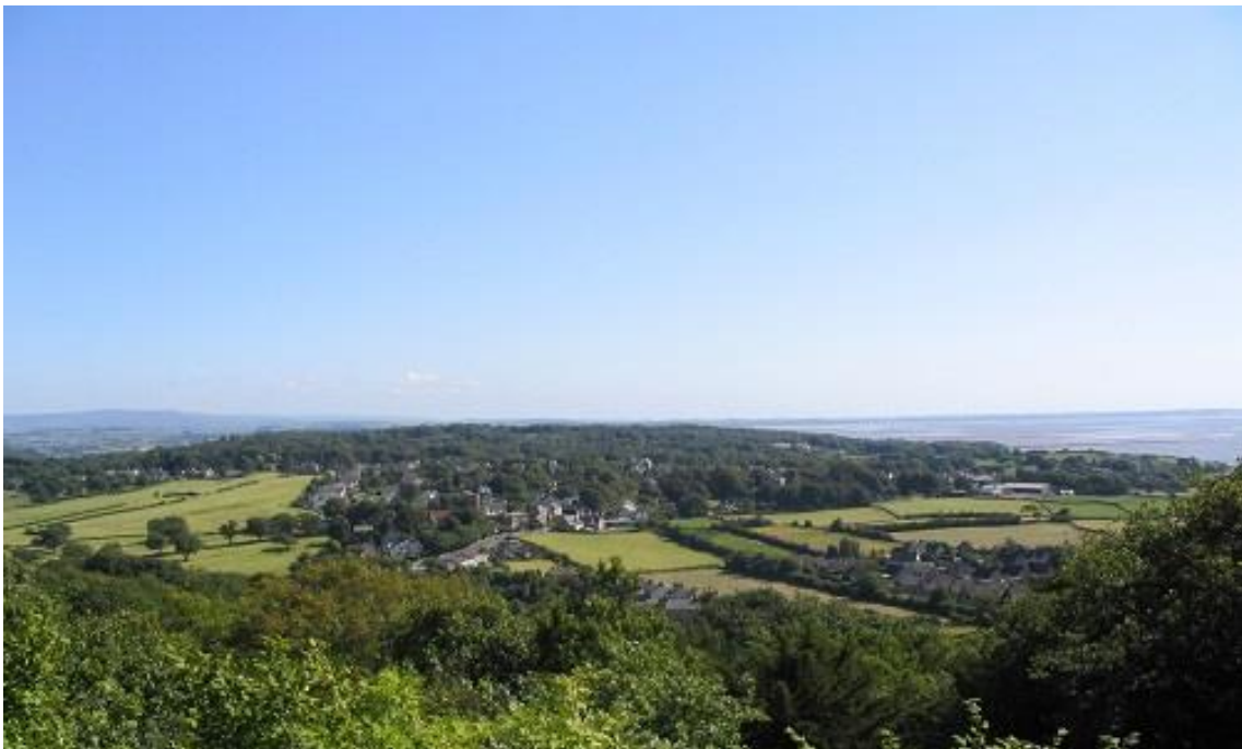
View of Silverdale

While there is evidence of occupation within the AONB dating back some 12,000 years, it is the stone buildings and settlements created during the last 800 years which contribute so strongly to the character and quality of the landscape today. This contribution lies not only in the strong vernacular traditions of the area but also in the settings of many of the buildings and the character of individual villages and hamlets.