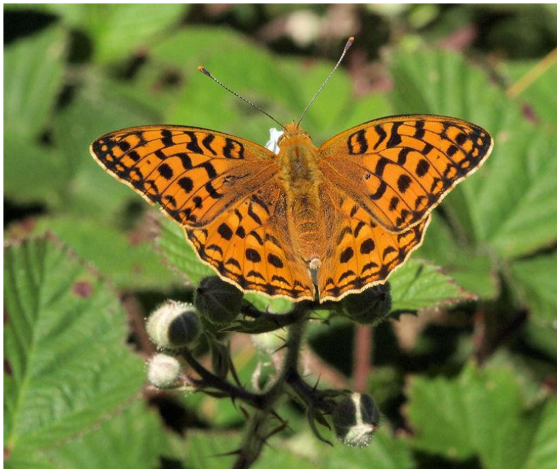
High Brown Fritillary

The numbers and diversity of butterflies are particularly impressive with 34 species occurring here. Well over half the UK's flowering plant species have been recorded along with many notable breeding birds and internationally significant numbers of waders on high tide roosts and feeding on long distance migrations along the coast each autumn.