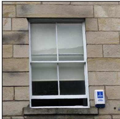
A typical sash window

century and saw much new building, including terraces. These too would have had sash windows.