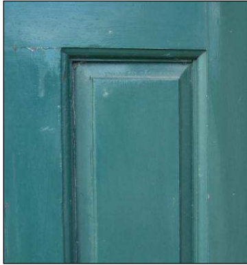
Raised and fielded panel

The number of panels in the door varied. However, the classic early Georgian arrangement comprised six panels which followed the strict Palladian principles of proportion, which was also applied to the fenestration of many buildings. The top two panels would be far smaller than the middle two which were slightly taller than the bottom two.