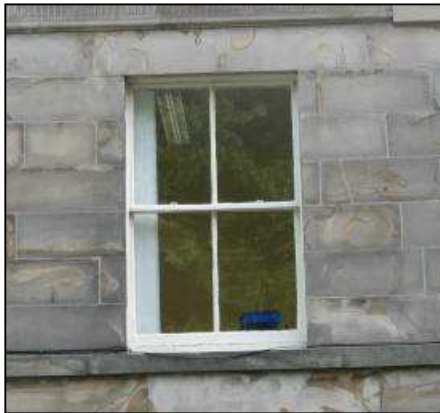
An early to mid-C19 window

By the 1830s, strong plate glass was becoming more affordable which meant that glazing bars were no longer necessary and were gradually designed out of many windows all together. By 1850, many sash windows had no internal glazing bars at all. However, in the absence of any internal supports, sash horns were introduced to the upper frame to help strengthen the vulnerable joints at either end of the meeting rail.