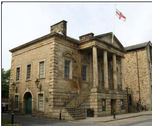
Maritime Museum, St George's Quay

Sash windows were first recorded in the late seventeenth century, but they are commonly associated with the Georgian period. During the early Georgian period, the glazing bars and meeting rails tended to be much thicker and heavier, and most glazing bars took the form of the ovolo moulding. An example of this can be seen at the Maritime Museum on St George's Quay, a building dating from 1760s.