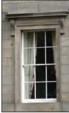
A late C18 sash window

By the 1830s, strong plate glass was becoming more affordable which meant that glazing bars were no longer necessary and were gradually designed out of many windows all together. By 1850, many sash windows had no internal glazing bars at all. However, in the absence of any internal supports, sash horns were introduced to the upper frame to help strengthen the vulnerable joints at either end of the meeting rail.