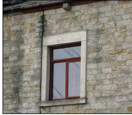
Inappropriate window styles