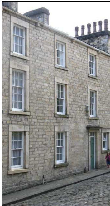
Palladian principles of proportion applied to the fenestration

The number of panels in the door varied. However, the classic early Georgian arrangement comprised six panels which followed the strict Palladian principles of proportion, which was also applied to the fenestration of many buildings. The top two panels would be far smaller than the middle two which were slightly taller than the bottom two.