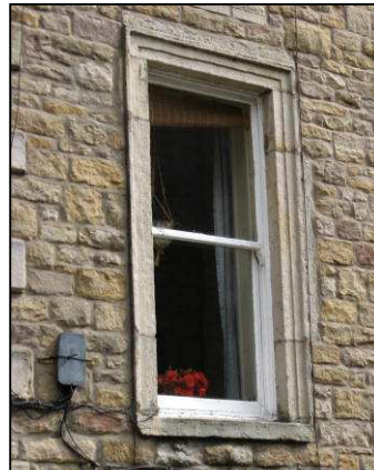
A Victorian sash with sash horns

Clearly, buildings do not remain static and many are altered over time. It may be the case, therefore, that an eighteenth century house now has Victorian windows. We are not advocating that these be removed since they are historic windows themselves and reflect the building's historic development. However, where inappropriate modern windows have been installed, such as those shown below, these should be replaced and the window pattern returned to how it would have appeared at the time it was built.