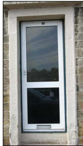
Inappropriate modern doors

Front doors were varied to denote status. Therefore, the more expensive the property, the deeper and more elaborate the mouldings used to frame the panels.