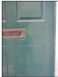
An example of a solid lower panel

It was common for the bottom panel(s) to be made of thicker timber and raised flush with the surrounding members making the base of the doors more able to withstand kicks and scuffs.