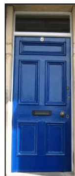
Panelled door combinations