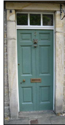
Classic early Georgian door patterns

It was common for the bottom panel(s) to be made of thicker timber and raised flush with the surrounding members making the base of the doors more able to withstand kicks and scuffs.