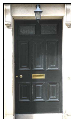
Heavier bolection moulded doors