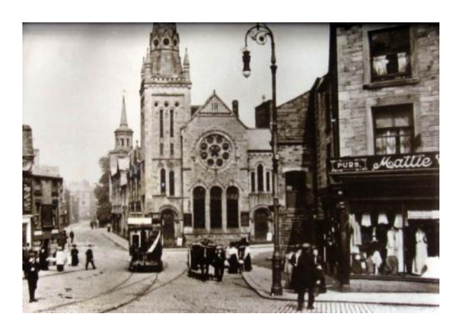
Stonewell in c.1900

leisure and offices have given some historic buildings a new life, such as the Moor Lane Mills.