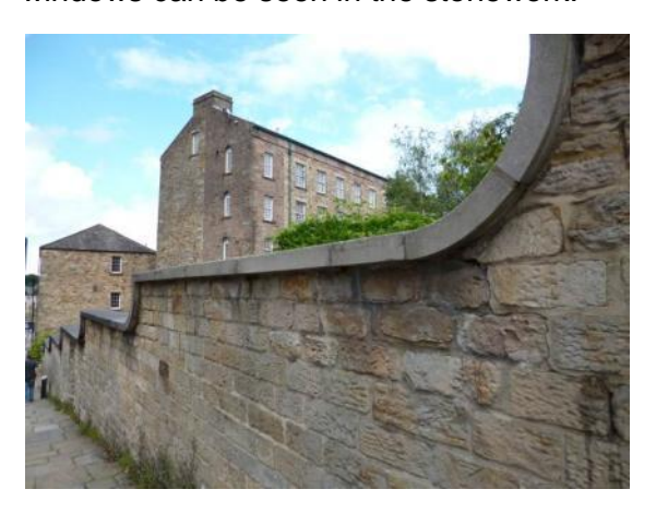
Wall on Moor Lane

Boundaries between properties have largely been lost due to phases of redevelopment, but east of St Leonard's Gate there are some examples of stone walls to former Georgian gardens that have been retained and these are historically significant. On Moor Lane, the stone walls with swept copings that adjoin the canal bridge are a distinctive feature next to the Moor Lane Mill North. Fragments of stone walls remain on the car parks east of Bulk Street, evidence of the cleared workers' housing; fireplaces, blocked doors and windows can be seen in the stonework.