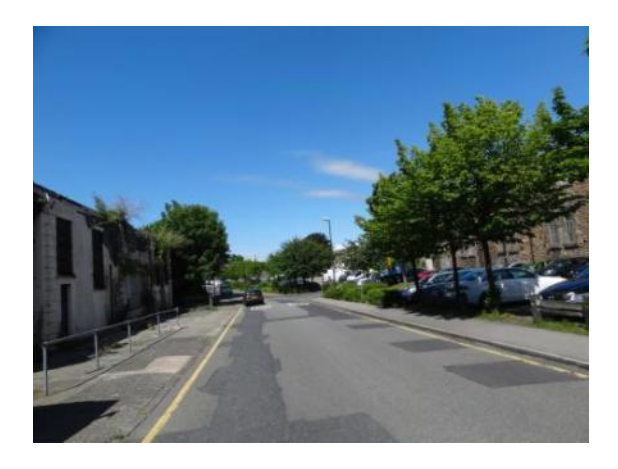
Tree planting improves the street scene

There are also a surprising number of trees within the industrial area. Located within private forecourts they serve to soften the street scene and improve frontages where built form is set back.