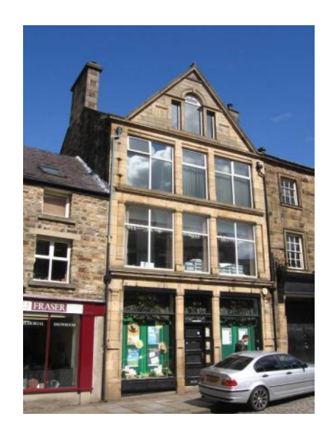
Purpose-designed showroom, 1891, Moor Lane

Where historic metalwork survives on railings, it is an important part of the area's historic character.