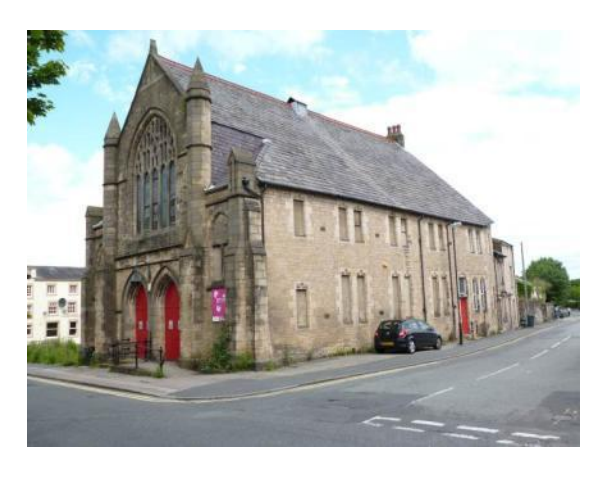
Former Methodist Church, Moor Lane, 1895