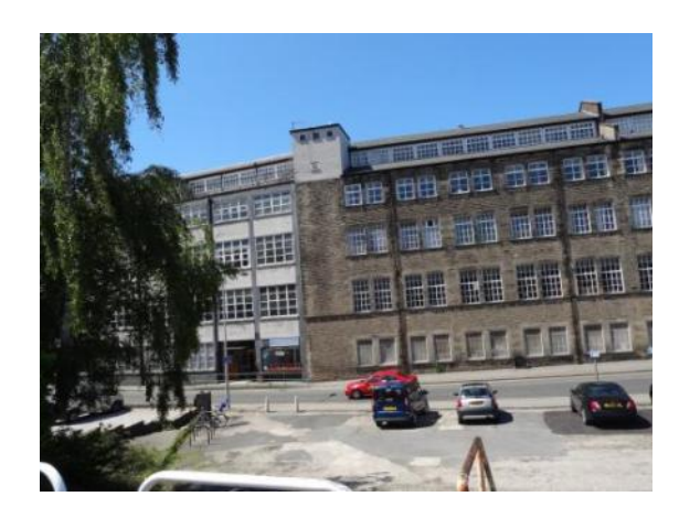
Former Gillow works on St Leonard's Gate

Buildings in the area generally directly front the back-of-pavement. In places where the street form has been lost new low-rise employment development is sited within enclosures, usually behind a galvanised steel fence. Older industrial buildings directly adjoin the pavement but often various buildings are grouped together around courtyards or in a more ad-hoc manner. In this case the primary frontage and entrance to the building often does not face the street (especially on Moor Lane). The frontages of the older mills and factories generally have a uniformly consistent pattern which emphasises their massing - especially on St. Leonard's Gate. Although monotonous, the frontages of the former Gillow works are architecturally interesting and the many windows to provide a sense of activity. The later development on the site replicates the scale and overall proportions of the older buildings.