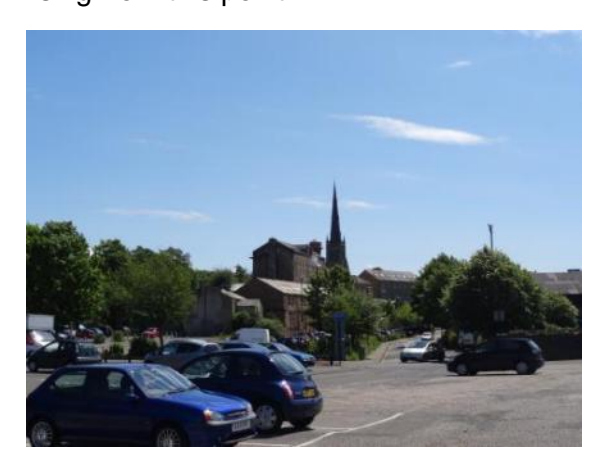
View south from the northern part of the area

The topography of the area rises gradually to the south and east awayfrom the City Centre. This is most noticeable on St Leonard's Gate and Moor Lane. The highest point of the area is the canal, from where good medium range views can be gained south and westwards towards the Cathedral. Within the area, buildings and mature trees partially block most of these views but landmark buildings are often visible, for example the spire of the former Congregational Church (now The Friary) which can be seen terminating the view down Lodge Street. From Stonewall, attractive street vistas can be seen looking up St Leonardsgate and Moor Lane, this view benefiting form the fact that these roads are rising from this point.