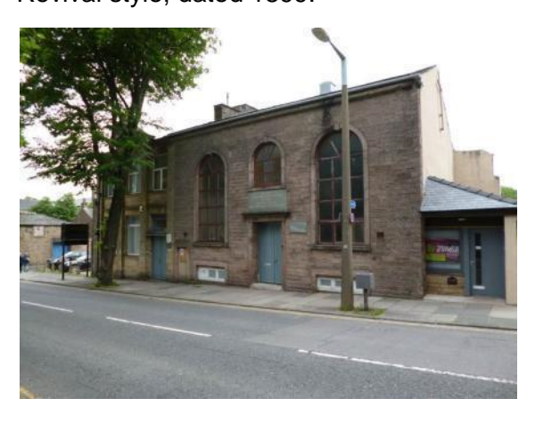
Former Primitive Methodist chapel built in 1829, Nelson Street

earlier chapels are in a restrained Georgian style, such as St Anne's Church, now the Duke's arts centre. This is in contrast with later 19<sup>th</sup> century churches that were designed in flambovant Gothic Revival style. resulting in assertive gabled buildings with turrets and steeples, such as the former Congregational Church facing north into Stonewell. These have landmark quality. The early 19th century Volunteer Hall and Club premises off Phoenix Street are an example of community facilities. Revival styles were popular for business and commercial premises; the massive offices built for Gillow on North Road were designed in a severe Tudor style by Austin & Paley, with gables and mullioned windows. The former carriage showroom on St Leonard's Gate is an unusual example of a free Gothic Revival style, dated 1899.