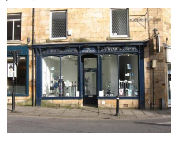
Timber shop-front on St Leonard's Gate

Some shops retain good examples of timber shop fronts dating from the late 19<sup>th</sup> century or early 20<sup>th</sup> century, either in adapted former houses or in purpose-built premises. The gabled showrooms on Moor Lane have large display windows to the frontage, framed by stone pilasters. The warehouse behind is plainer, but also stone.