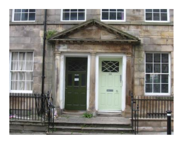
Georgian doorways on St Leonard's Gate

iron with some timber gutters On corbels There is a very wide range of windows and door patterns, depending on the date and function of the building. Domestic buildings generally have sash windows, although some have been replaced with modern patterns. Industrial premises in this area have smallpaned windows, usually in timber, and historic joinery has survived on the Heron Chemical Works and on the North Road mill.