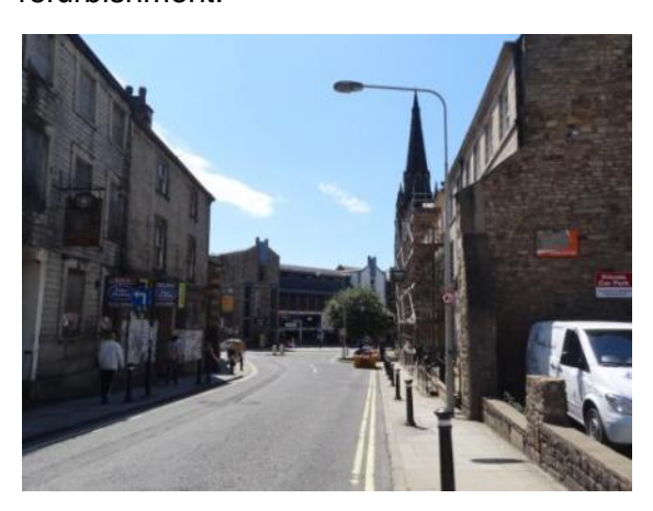
Gateway to the area seen from St Leonard's Gate

The south-western corner of the area includes two adjacent gateways. The junction of Rosemary Lane and St Leonard's gate is effectively an entry point to this character area on St Leonard's Gate, although City Centre uses still dominate in this area. This is a positive gateway, with strong built form and well defined by the former Congregational Church and its spire, although some buildings on St Leonard's Gate are in need of refurbishment.