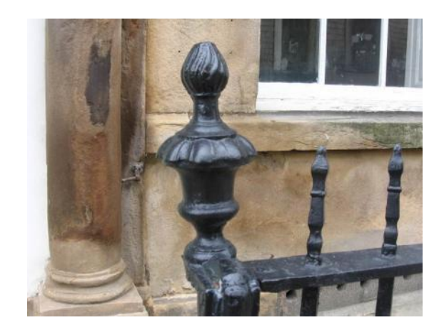
Georgian ironwork on St Leonard's Gate

Where historic metalwork survives on railings, it is an important part of the area's historic character.