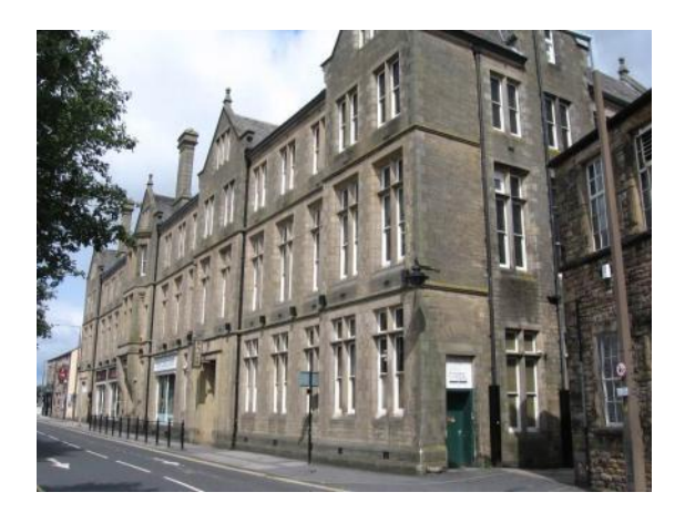
The Gillow showroom and offices on North Road, 1882

along Damside Street (now North Road) in the late 18<sup>th</sup> century, greatly expanded in the 19<sup>th</sup> century and early 20<sup>th</sup> century. Small-scale manufacturing was also a feature of the area, with a carriage works on Lodge Street built in the 1880s. Phoenix Street was named after the Phoenix Foundry, run by Edmund Sharpe in the 1850s; this was just outside the area.