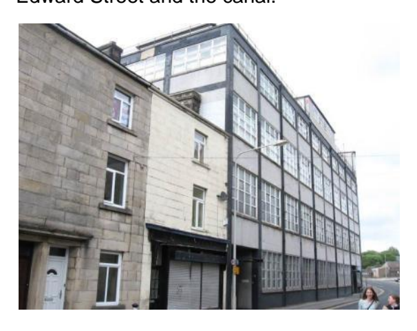
The reinforced concrete-framed Gillow works, early 20<sup>th</sup> century

Plainly built stone workshops behind frontages contribute to the area's varied character, although these are less prominent; some can be glimpsed up yards and through covered entrances. Behind the Duke's, north of Moor Lane is a former timber yard with ranges of stone-built workshops. Off the east side of North Road are setted yards with workshops and industrial premises, such as Pitt Street and Sugar House Alley. The gabled forms of the late 19<sup>th</sup> century chemical works are a distinctive feature, in views from Edward Street and the canal.