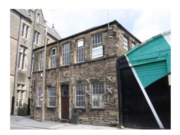
Early 19th century textile mill on North Road

North Road. The scale of these is generally 2 or 3-storey, but the multi-storey Moor Lane mills and the Gillow premises have a more dominating presence in the townscape.