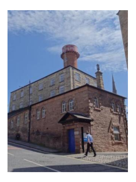
Moor Lane Mills South, in office use

The area had a strong industrial past. This is clearly evident from the Victorian and early 20th century architecture that still dominates the site. As manufacturing industries have declined many of these buildings lie vacant, sometimes in poor condition or undergoing repair. Newer employment uses occupy some of these buildings (at least partially) and also occupy newer smaller-scale industrial buildings. Elsewhere large swathes of land have been cleared, for the previously proposed eastern relief-road, and are now under-utilised as large surface car parks. Moor Lane Mills South has successfully been converted for use as offices, and Moor Lane Mills North to student accommodation. The Grand Theatre is a significant local building. which is fortunately still in its original use. In the western edge of the area (i.e. on Rosemary Lane and Stonewell) edge-ofcentre uses dominate: for example secondary retail and small scale offices. Only a few buildings are in residential use.