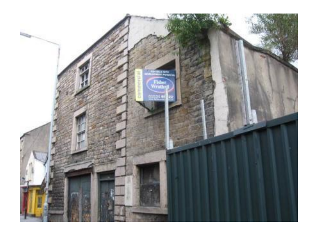
Neglected buildings on North Road