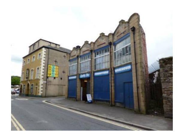
Former carriage showroom, 1899, with the Grand Theatre beyond

Some shops retain good examples of timber shop fronts dating from the late 19<sup>th</sup> century or early 20<sup>th</sup> century, either in adapted former houses or in purpose-built premises. The gabled showrooms on Moor Lane have large display windows to the frontage, framed by stone pilasters. The warehouse behind is plainer, but also stone.