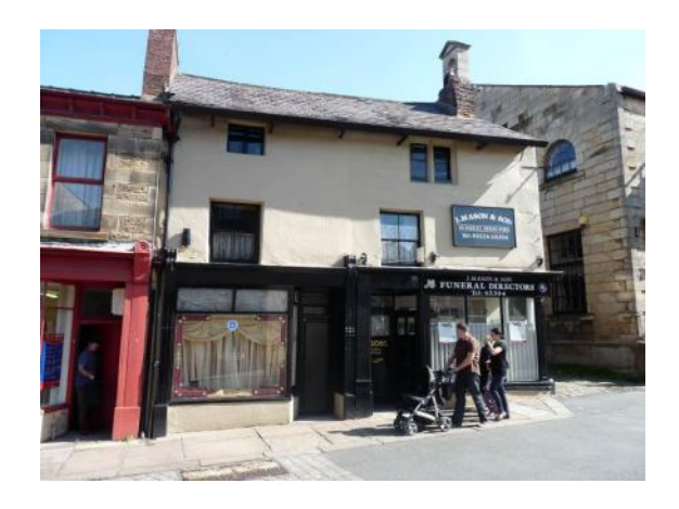
17-19 Moor Lane, retains 17th century fabric

Domestic buildings are also important and several buildings on Moor Lane retain earlier timber-framed fabric behind later frontages. The remains of workers' housing in yards such as Swan Court and east of Bulk Street merit recording, even where some loss has occurred; sections of walls retain features such as doors and fireplaces..