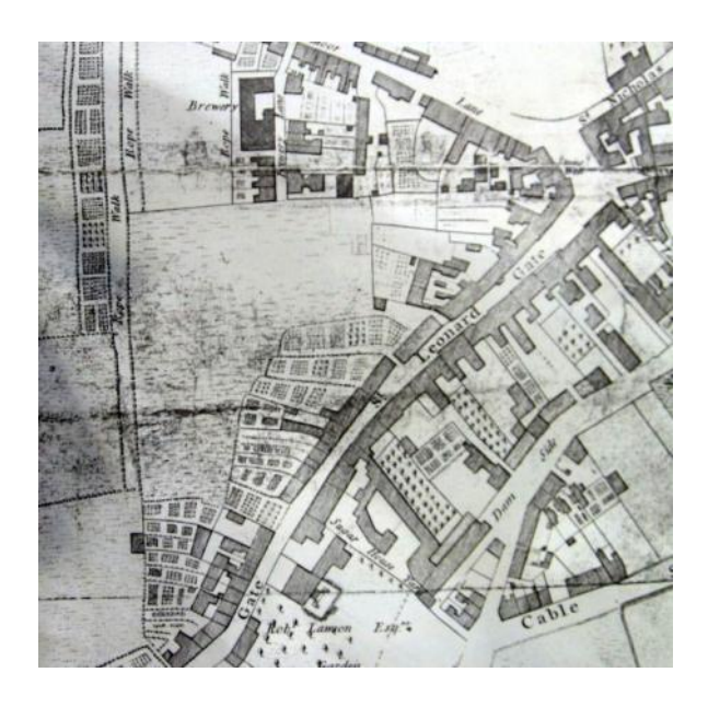
Part of the area in 1778, Mackreth's map, south is to the top

was on the east edge of the Roman and Medieval town, and the main streets have early origins: Stonewell was an important junction with Lower Church Street, Rosemary Lane. St Leonard's Gate. Moor Lane and the now lost St Nicholas Street. This junction was probably on a Roman route east out of the town, leading to pottery kilns at Quernmore. The north-west edge of the area follows North Road (formerly known as Damside Street), laid out along the line of the medieval mill race that served the town's corn mill. In the medieval period, St Leonard's Gate was an important road, leading east to the Lune valley, and named after the 12<sup>th</sup> century leper's hospital of St Leonard's at Factory Hill just outside the town. This road and Stonewell were lined with houses, shown on Speed's map of 1610 and behind were rear gardens and yards. Stonewell takes its name from the stonelined spring or well in this location, also shown on Speed's map.