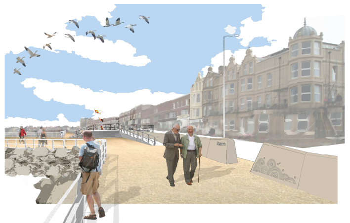
After - Artist's impression by kind courtesy of Atkins.