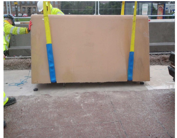
The First Unit Going In

Work will soon move down the prom along with work starting on the first up and over opposite Thornton Road.