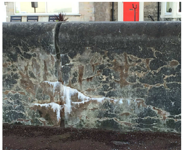
The current wall showing signs of ASR

The project is supported by funding from the Environment Agency and will be undertaken through 3 distinct phases. By replacing it now, we continue to protect 12,000 homes and businesses from flooding.