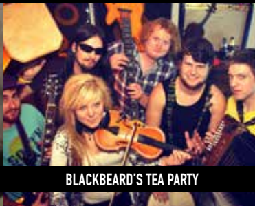
BLACKBEARD'S TEA PARTY