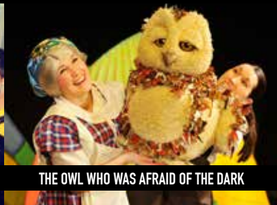
THE OWL WHO WAS AFRAID OF THE DARK