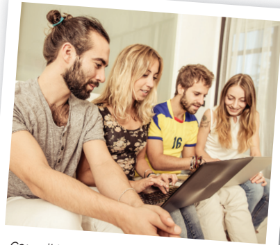
Council tax is not charged on student properties.