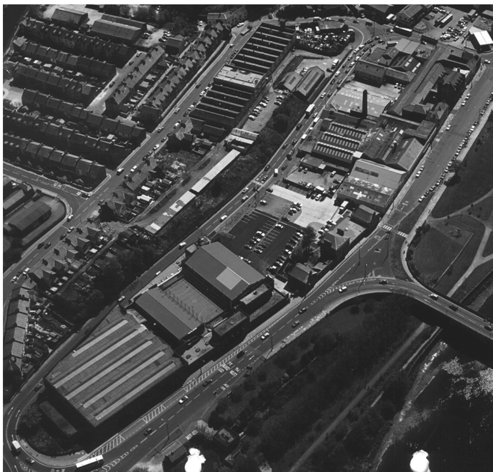
An aerial view of the Kingsway site

2.4. Opposite the south end of the site, on the other side of Bulk Road, is a small retail park containing Currys, Comet, and Halfords. The city's Sainsbury store and car park lie opposite the Bulk Road / Parliament Street junction.