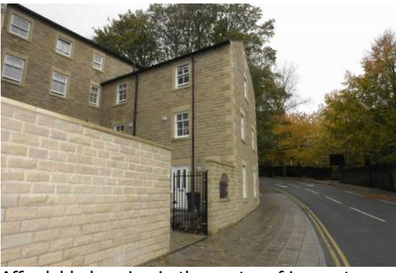
Affordable housing in the centre of Lancaster

affordable home in the district, therefore for anyone to be considered for an affordable home they must first apply to join the housing register. Housing need is then assessed using a banding scheme ranging from 'emergency housing need' to 'very low housing need'.