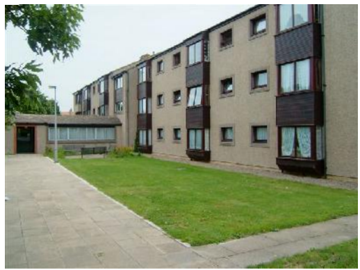
Council owned housing at Kingsway Court, Heysham

4.10 The council considers housing to be affordable where it meets the criteria in Annex 2 of the NPPF. Therefore affordable housing can either be social rented, affordable rented or intermediate housing that is provided to eligible households whose needs are not met by the market. The full NPPF definition of affordable housing is set out in the Glossary of this SPD.