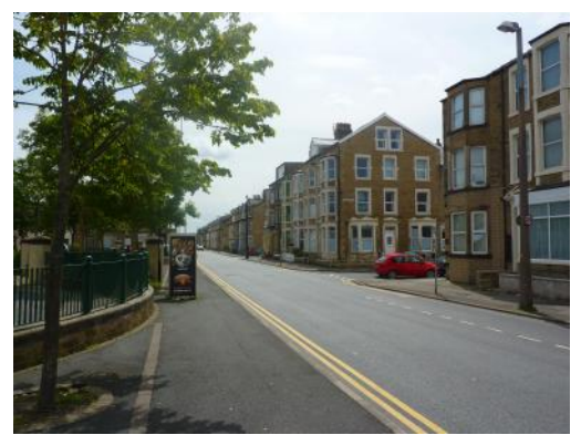
Victorian housing in the West End of Morecambe