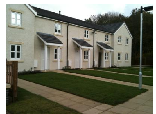
Affordable housing development at Windermere Road, Carnforth.