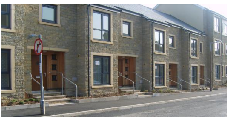
Affordable housing development at Marlborough Road, Morecambe

4.37 All of the council's rented accommodation, as well as some affordable housing provided by registered providers is allocated through Ideal Choice Homes, the choice based lettings system for the district. Full details about the housing register are contained within the council's Housing Allocation Policy which can be downloaded at: www.lancaster.gov.uk/apply-home/