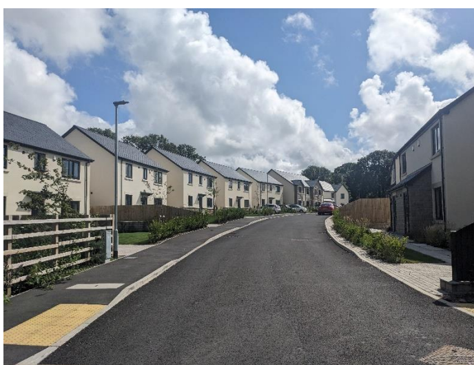
Figure 2 – Housing Development in Over Kellet

5.2 Housing completions over the last 12-month period were mainly concentrated in the Lancaster and rural sub-areas of the district. This included completions on Ashton Road, Bowerham Road and Slyne Road in Lancaster as well as completions at Halton, Over Kellet, Dolphinholm, Cockerham and Galgate. The development on Scotland Road in Carnforth is responsible for nearly all of the completions recorded in that sub-area.