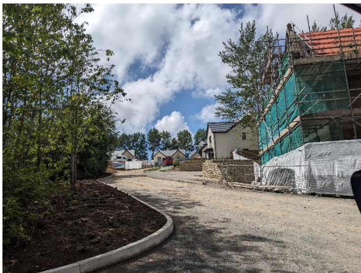
Figure 4: Ashton Road, Lancaster housing development

6.3 As in previous years the housing commitment by geographical distribution is monitored. This is shown in table 4 below. This is reported for the total commitment in the district as of the 1 st April 2024 and for new approvals granted permission between 1 st April 2023 and the 31 st March 2024.