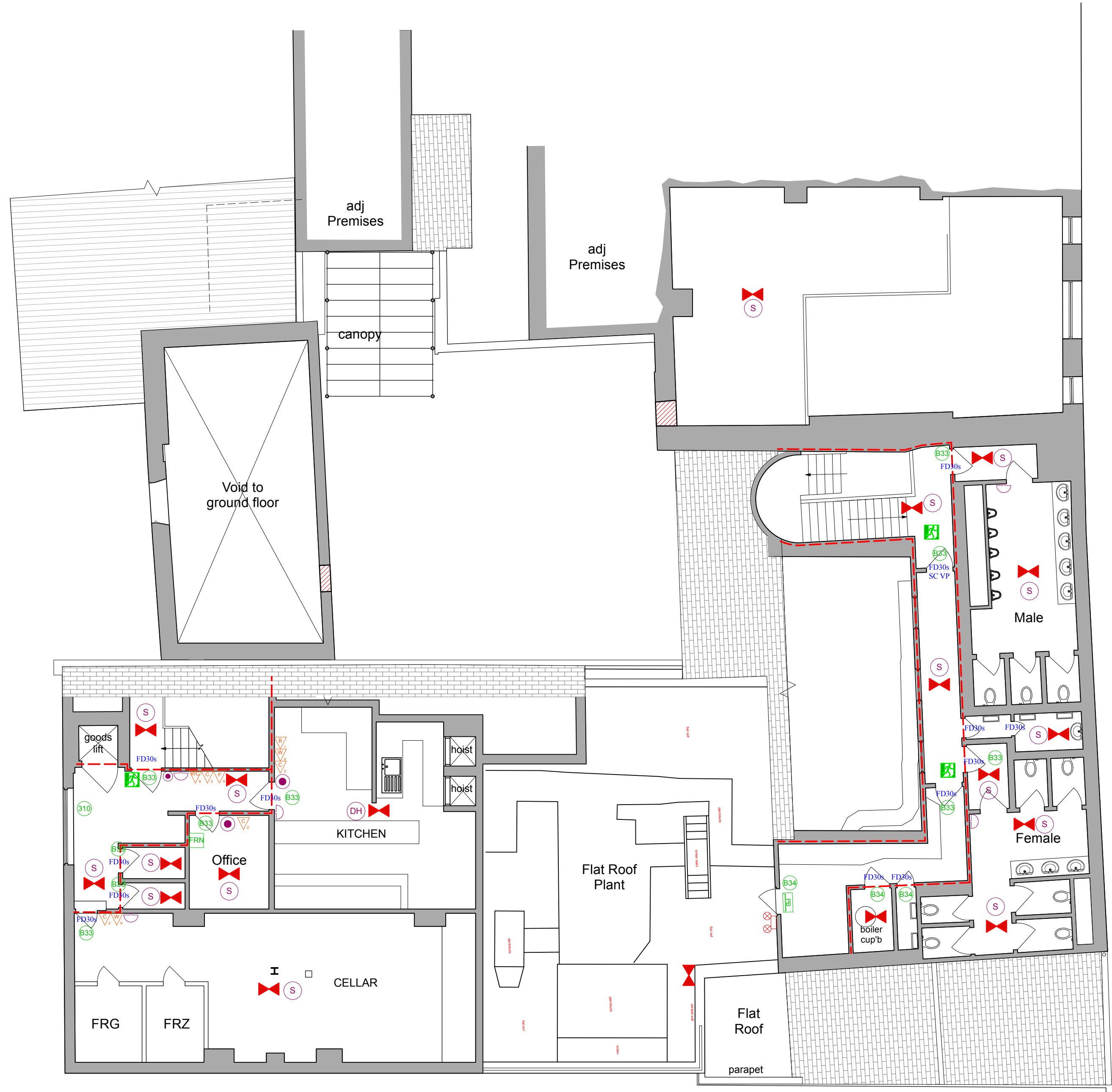
2 FIRST FLOOR PLAN Scale: 1:100