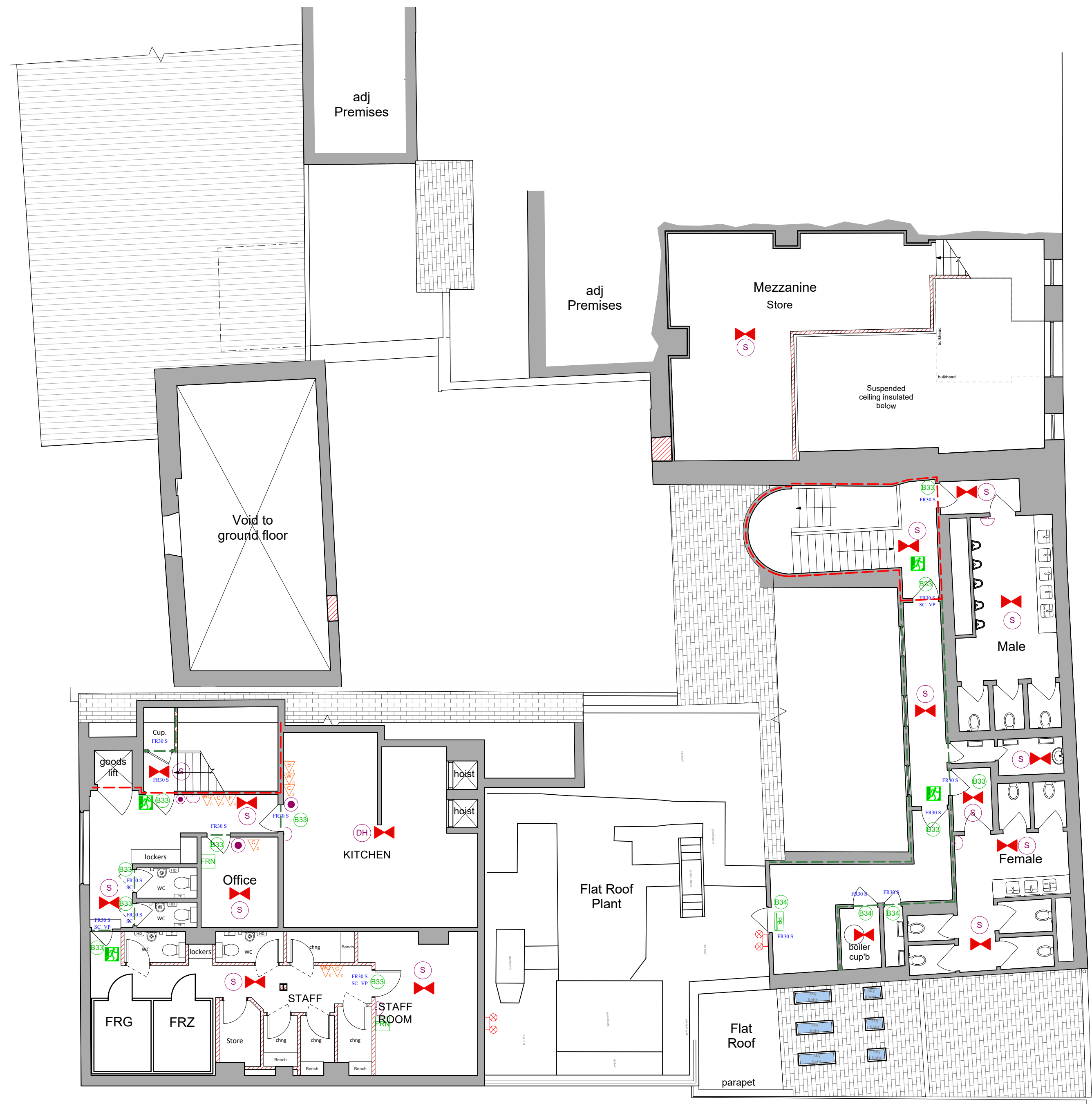
2 FIRST FLOOR PLAN Scale: 1:100