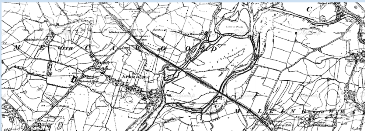
Fig. 16 OS map (1:10,000) of Arkholme in 1890, showing the linear settlement plan form and the development of the railway on the outskirts of the village.

There are records and physical evidence of Arkholme's post-conquest historic development. In the 11th century a cluster of motte and baileys were established along the Lune Valley, including Arkholme, to impose a new sense of order through the controlled movement along the river valley. The Lune Valley was a key frontier in William the Conqueror's 'Harrying of the North' campaign 1069 to 1070 against the Northern rebels in Lancashire, Yorkshire and Cumbria. In 1066, Arkholme was also recorded as six plough-lands as part of Earl Tostig's fee of Whittington manor. The township later became part of the Lordship of Hornby (Farrer and Brownbill 1914).