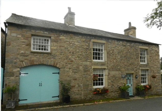
Fig. 19 Brunt Hill House was built as a farm building (on the left) and a dwelling (on the right) under the same roof.

Arkholme's buildings are mainly characterised by their individuality and vernacular style of construction, which developed as a response to the local availability of materials before the growth in transport in the late-19th century. During the post-medieval period, a mixture of residential and farm buildings developed. Some buildings were constructed as a mixture of both, for example Brunt Hill House demonstrates the traditional 'laithe house' that housed people and animals in one building (although separated within the building).