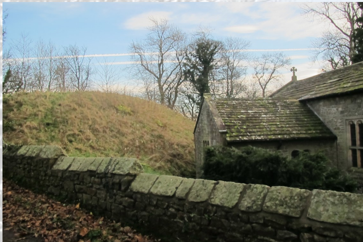
Fig. 25 Capel Hill motte is situated within the grounds of St John Baptist church.

The area surrounding the monument has become very enclosed with the development of the church and the boundary of the churchyard. Consequently, this area has limited potential as a resource for future archaeological research or interpretation of the site.