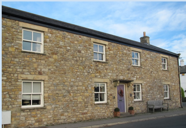
Fig. 22 Modern housing fronting the main highway which responds well to Arkholme's vernacular character.

Architectural detailing, which crucially contributes to the historic character of Arkholme, has generally been well-retained. A very small proportion of unlisted buildings within the conservation area have replaced traditional windows and doors for modern unsympathetic alternatives, such as PVCu.