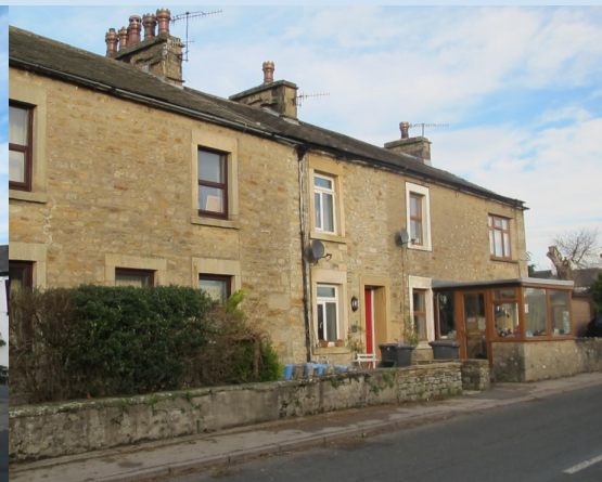
Fig. 23 Use of non-traditional materials, such as upvc, for windows and doors negatively impacts the character of Arkholme's conservation area.

Overall, the overriding impression of Arkholme is a historic farming and residential village due to the arrangement, plan form and materials used in the construction of buildings. The conservation area has a strong architectural quality due to the retention of many of its buildings and architectural detailing dating from the post-medieval period of vernacular construction. Some inappropriate alterations and modern developments have threatened this strong architectural quality and historic character, however the impact on the significance of the conservation area has not been detrimental and the area still retains much of the quality for which it was designated. The built form and architectural quality of the village continues to contribute to a local 'sense of place' and national heritage.