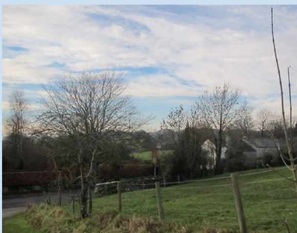
Fig. 14 View from the incline near Goss Farm.

Important vantage points include the incline near Goss Farm and along Main Street looking west. These have been identified on a townscape analysis map in Fig. 8.