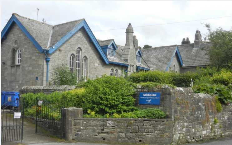
Fig. 17 The school and schoolmaster's house were built in the mid-19th century, it demonstrates the end of the vernacular building tradition as architecture began to be influenced national revival styles, as seen with the pointed arch detailing of the windows.

In 1279 Geoffrey de Nevill obtained a charter for a market at Arkholme; demonstrating the continued population of the village (Farrer and Brownbill 1914). The existing Arkholme church has 15th century origins and has undergone many alterations between the 18th and 20th centuries. During this period, the village will have been characterised by agricultural activities. Farming started as an activity in the 'common fields', and during the medieval period piecemeal enclosure of those open fields began (Brunskill 1978). Although records are limited, the linear settlement plan of the village is likely to have been inherited from this period of enclosure.