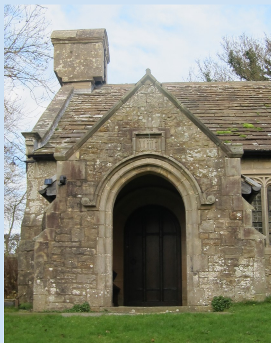
Fig. 4 St John Baptist church is grade II*. The building has parts which date back to the 15th century. A lot of the church was restored by local architects Austin and Paley in the late 19th century.