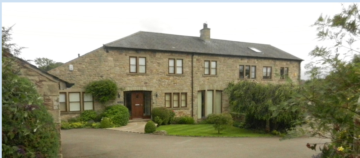
Fig. 5 Goss Lodge appears on the 1845 OS map as part of the land of Goss House. It has been converted to residential use, but like many other buildings in Arkholme it has retained its traditional barn door openings.