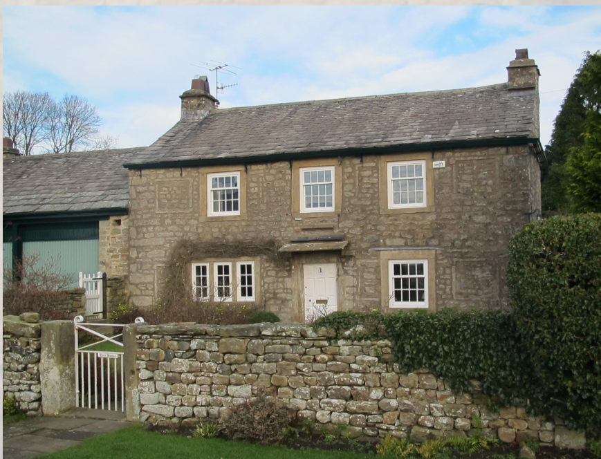
Fig. 18 Cort House dates from 1700, it has been traditionally constructed in sandstone rubble with a slate roof.

In 1867, the Furness and Midland Joint Railway opened connecting Wennington and Carnforth. However, massive railway economic restructuring occurred nationwide in the latter half of the 20th century, subsequently the 'Arkholme for Kirkby Lonsdale' station closed in 1960. Although not within the conservation area, it is important to note how the development of the railway has not significantly influenced the development of buildings near this transport link. Arkholme is also known as one of two 'Thankful Villages' in Lancashire, as it is a rare place that all the men sent to fight in the First World War between 1914 and 1918 returned to their homes with no fatalities.