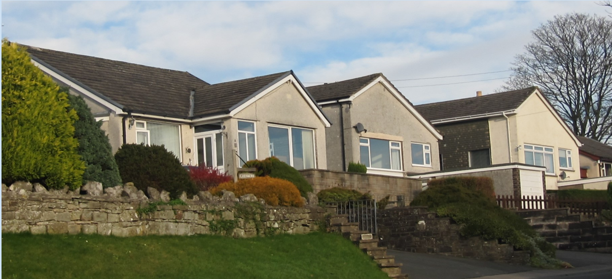
Fig. 32 Some modern housing within the conservation area do not respond to Arkholme's distinctive vernacular construction.

Some insensitive housing developments which are uniform in their construction and disconnected from the local built tradition threaten to undermine the historic character and uniqueness to which the area was designated for. Continued unsympathetic developments will erode the architectural and historic interest. It should, therefore, be thoroughly understood how the village has developed historically and how the buildings were formed to best inform a sympathetic development design which preserves and enhances the architectural quality and individuality of Arkholme.