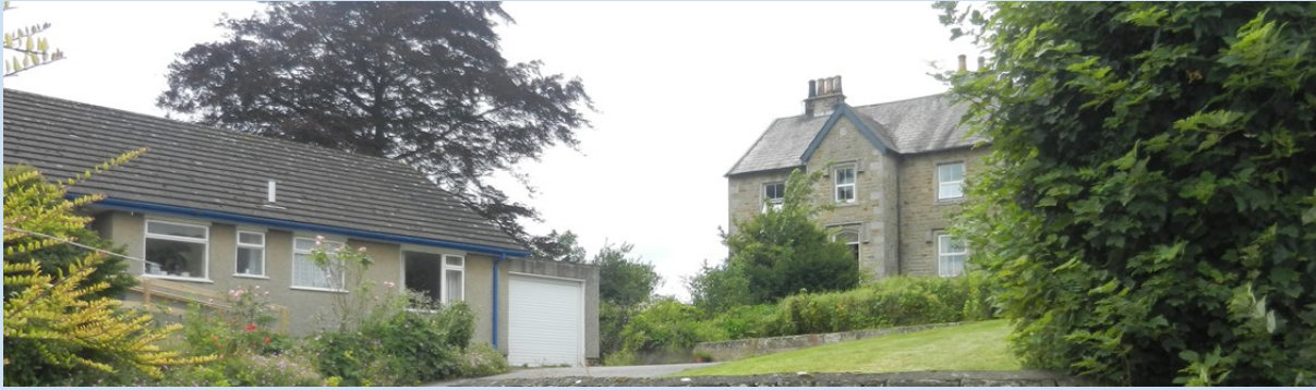
Fig. 11 Modern bungalow in a non-traditional style in the foreground of a positive unlisted building within Arkholme.

Modern housing development demonstrates the 20th century popularisation of rural living. Some modern housing has responded to Arkholme's vernacular character with a complimentary and balanced use of traditional materials and massing with a contemporary plan form. There has, however, been some unsympathetic housing development that does not relate to the local geology the same way vernacular post-medieval buildings have. In some areas, the character has been somewhat eroded and the setting of heritage assets have been negatively impacted as a result. Nonetheless, some of this unsympathetic development has been mitigated by the use of trees and boundaries along the front of the properties.