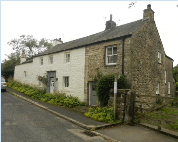
Fig. 33 Meadowlands and Rose Cottage have strong aesthetic and historic heritage value.

Some insensitive housing developments which are uniform in their construction and disconnected from the local built tradition threaten to undermine the historic character and uniqueness to which the area was designated for. Continued unsympathetic developments will erode the architectural and historic interest. It should, therefore, be thoroughly understood how the village has developed historically and how the buildings were formed to best inform a sympathetic development design which preserves and enhances the architectural quality and individuality of Arkholme.