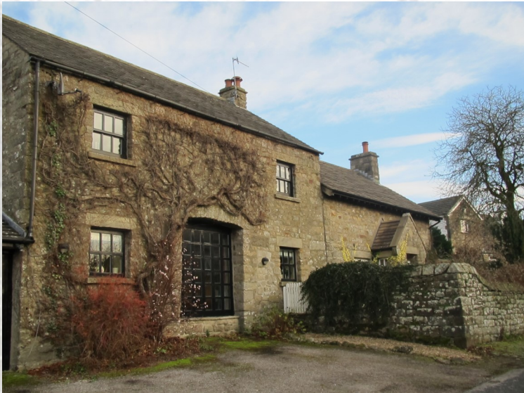
Fig. 9 Architectural detailing associated with the previous agricultural use has been well maintained in Arkholme, as can be seen with the retention of the segmental arched barn door opening after the building was converted to residential use.

Arkholme's conservation area encompasses the vast majority of the village due to its significant retention of its post-medieval development. The area has also retained an indication of its early historical settlement, which is visible in the scheduled monument, a motte, to the south east of the conservation area. Although primarily a rural residential area, many of the buildings have still preserved the evidence of their previous farming use in their names and construction. This cultural connection to past farming activities significantly links the village to the surrounding agricultural and rural setting, thus enhancing its historical character.