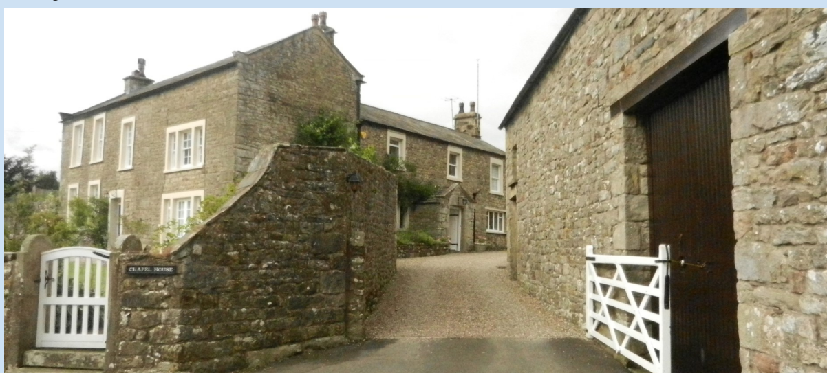
Fig. 24 Church House and The Loft, previously known as 'The Nook' on 1845 OS map, constructed in rubble sandstone.

Overall, the overriding impression of Arkholme is a historic farming and residential village due to the arrangement, plan form and materials used in the construction of buildings. The conservation area has a strong architectural quality due to the retention of many of its buildings and architectural detailing dating from the post-medieval period of vernacular construction. Some inappropriate alterations and modern developments have threatened this strong architectural quality and historic character, however the impact on the significance of the conservation area has not been detrimental and the area still retains much of the quality for which it was designated. The built form and architectural quality of the village continues to contribute to a local 'sense of place' and national heritage.