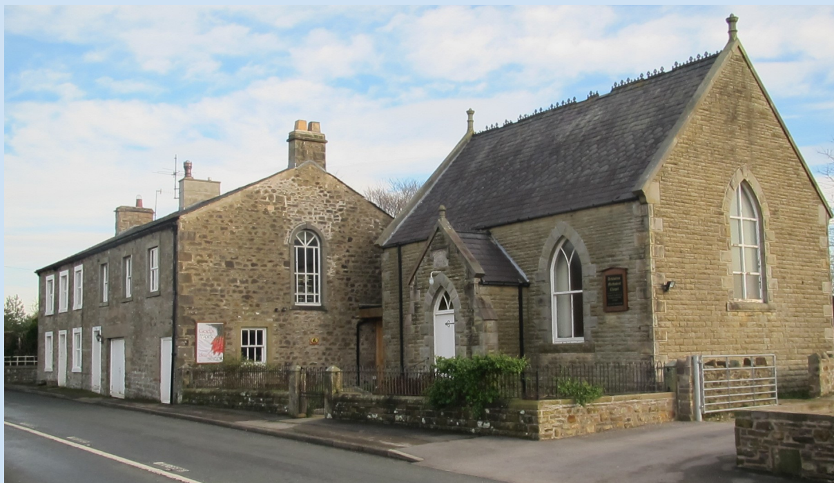
Fig. 28 The Methodist Church (on the right) shows Gothic-revival detailing in the pointed arched windows and doors. The Chapel Cottages (on the left) are constructed more traditionally with an arched window on the gable end.