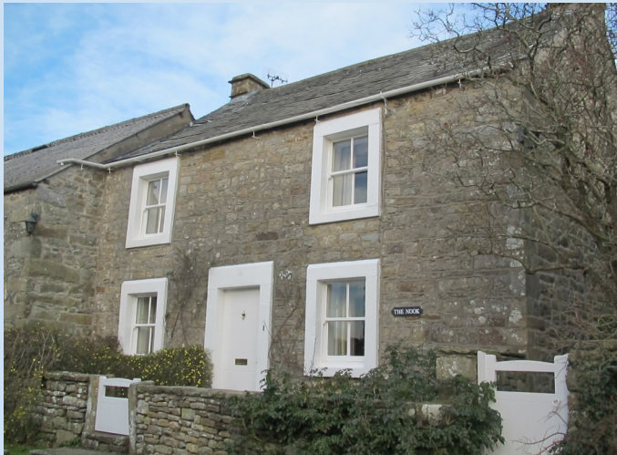
Fig. 27 The Nook along Main Street is a symmetrical house with sash windows and stone surrounds. It contributes positively to the vernacular expression of Arkholme's conservation area.

There are many listed buildings and structures within Arkholme's conservation area, as well as a scheduled ancient monument. In addition to these designated heritage assets, there are some non-designated heritage assets which add to the character of the conservation area and local identity of the district. Non-designated heritage assets that contribute to the significance of the conservation area are protected under the 1990 Planning (Listed Buildings and Conservation Areas) Act and the National Planning Policy Framework (NPPF). It is important to clearly identify these buildings as proposals for their demolition normally constitute substantial harm to the conservation area, which will require strong justification. There is a presumption in favour of the conservation of unlisted buildings that contribute to the character of the conservation area.