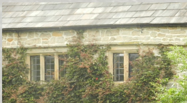
Fig. 20 Mullioned windows have been well retained at Pool House and contribute to the historic legibility of the building.