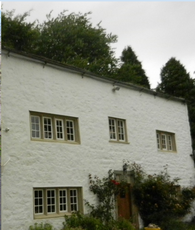
Fig. 13 Luneside, previously known as Lune Cottage, is a traditionally rendered house with a datestone of 1714 above the door.