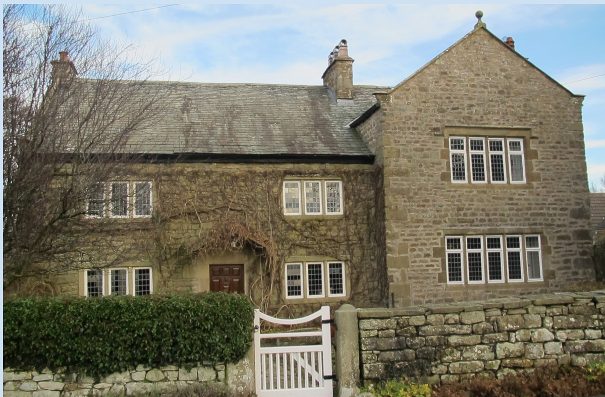
Fig. 29 Cawood House contributes to the strong architectural quality of Arkholme through its retention of traditional windows and slates.

In general, Arkholme's conservation area is in a good condition. As demonstrated by the conversion and reuse of previous farm buildings, the village has adapted well to the social and economic changes of the 20th century. This has contributed positively to the continued economic vitality and historic architectural character of the area. Due to this strength, the village will likely continue to offer an attractive place to live which has been highlighted by the growth in housing developments.