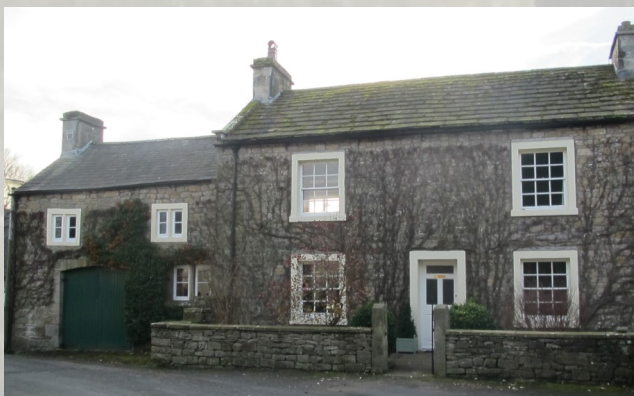
Fig. 21 Traditional construction and good retention of architectural detailing, such as sash windows at Caulking House.

The traditional post-medieval buildings are distinctively walled in sandstone random rubble, some left exposed whereas others are rendered. Vernacular masonry walling techniques have also been employed through the use of stone quoins. Predominantly, the buildings are roofed in diminishing courses of local grey slate, mostly gable ended with some outshut and catslide roofs.