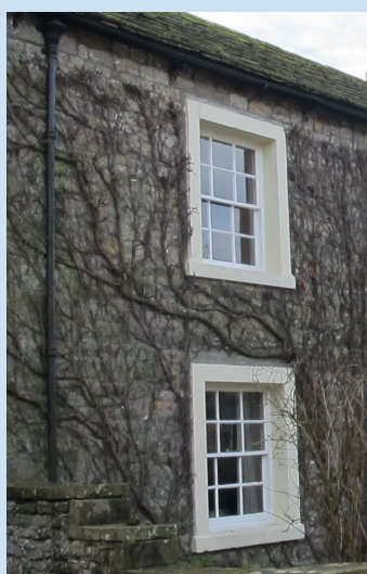
Fig. 30 Caulking House retains the traditional 6-over-6 sash window fenestration.