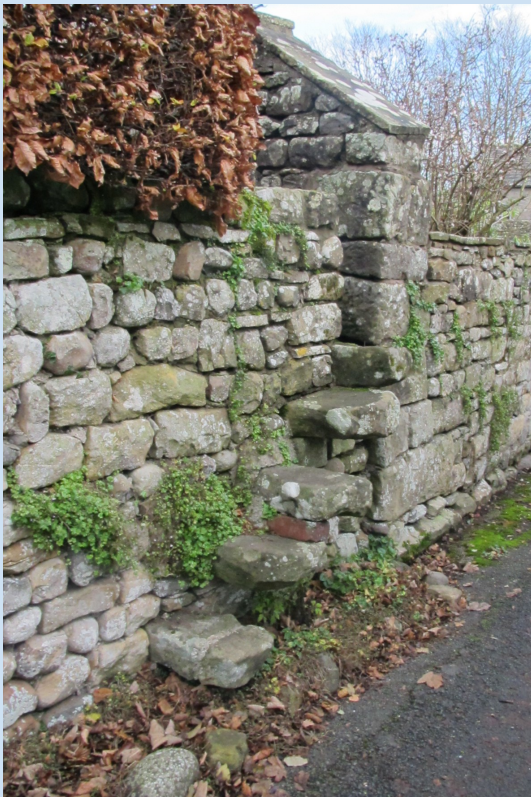
Fig. 12 Traditional drystone boundary walls characterise the village of Arkholme, some with flat coping stones.

The linear settlement plan of Arkholme has not been significantly altered since the survey of the 1845 OS map. It continues to crucially contribute to our understanding of the historic development of the local and national rural communities after the medieval period before industrialisation and globalisation dramatically altered the social and economic process of communities.