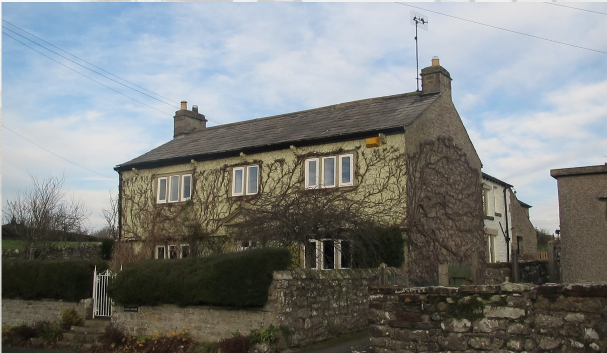
Fig. 7 Goss House is a mid-18th century house, which has been traditionally rendered. The house shows influence of international styles of classical detailing above the doorway with a dentilled pediment. However, the prevalent vegetation growth on the building could threaten the integrity of the built structure as the roots can penetrate joints and cause displacement of the stone.