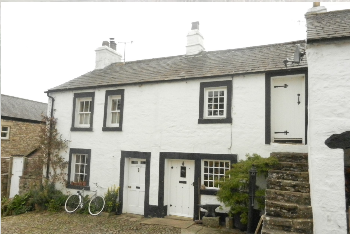
Fig. 10 Smithy Cottage is a pair of houses and former smithy from the early-19th century, which have been traditionally rendered to create a distinctive black and white appearance.

The vernacular constructed post-medieval buildings (dating from 17th to early 19th century) have created a distinctive aesthetic appearance as their construction responded to the local needs and availability of materials. What characterises Arkholme is the similar massing and scale of mainly two storey detached properties in a linear plan form, built with local materials such as sandstone and slate. This historic and vernacular character is also recognised in the Grade II listing of many of the cottages. In addition, public buildings developed at the heart of the village and their continued use has maintained the important sense of community.