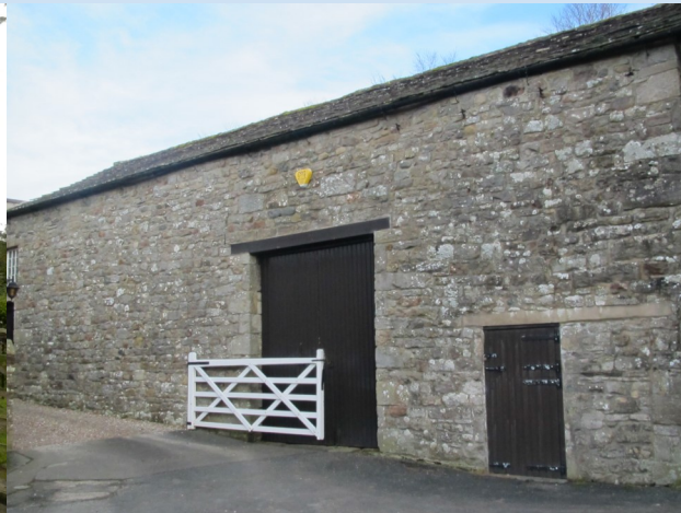
Fig. 34 Agricultural use is still prevalent in the legibility of Arkholme's buildings.

In summary, the conservation area is in a relatively stable condition as it has maintained much of its distinctive local architectural detailing, built form and character. The significance of Arkholme's conservation area relates to its strong retention of three main heritage values: evidential, historical and aesthetic (Historic England 2008). The collection of post-medieval buildings yield evidence about past human activity and the development of the area as an agricultural village. For example, the retention of barn door openings and the situation of buildings along a linear settlement plan form. This can also help illustrate how past people lived and worked within the area and contribute to the understanding of the village's historic development. One of the greatest heritage values of the area is the aesthetic value of the collection of buildings because the predominantly vernacular expression continues to define the local 'sense of place'.