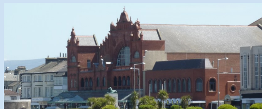
Fig. 3 View along Morecambe seafront and the Winter Gardens.