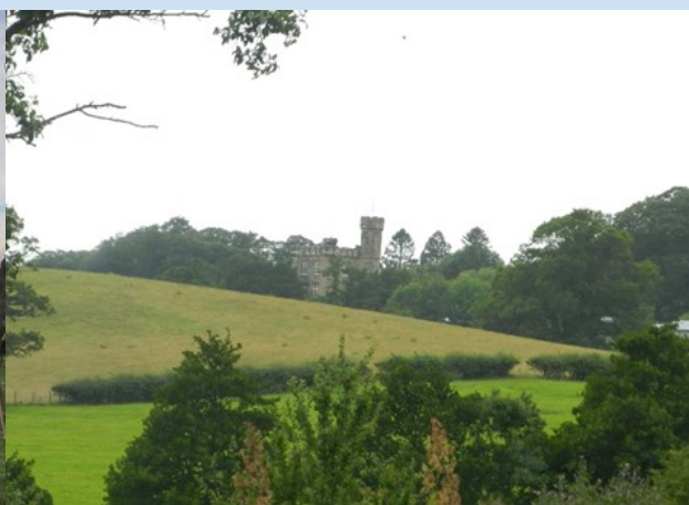
Fig. 15 View of the embattled tower of the Grade II listed Storrs Hall, facing west along Main Street.