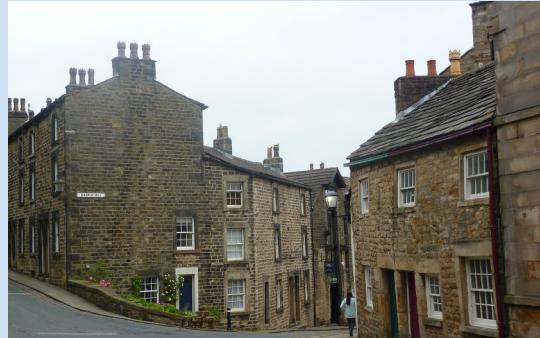
Fig. 1 View of Castle Hill in Lancaster, a collection of Georgian houses.

Morecambe has the novelty of the seaside resort architectural style; an eclectic mix of revival and art deco styles. Many rural conservation areas within the district are characterised by their vernacular building construction.