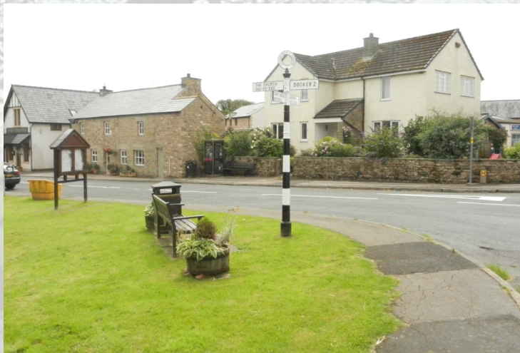
Fig. 26 Open spaces in the public realm are limited within the conservation area. There is an area of open space at the junction of Main Street with street furniture such as a bench, signpost and community noticeboard.

There are five Tree Preservation Orders within the conservation area, which can be identified in Fig. 8. Mature trees contribute to the setting of the conservation area and anyone proposing to cut down or carry out work to a tree within a Conservation Area is required to give the Local Planning Authority six weeks prior notice.