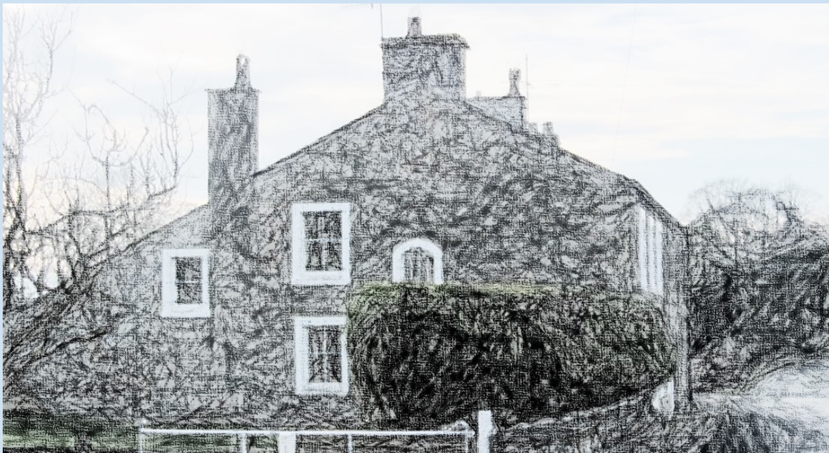
Fig. 2 Sketch of Chapel Cottages in Arkholme with a catslide roof on the outshut. The cottages have retained their architectural detailing, such as sash windows.

The purpose of this appraisal is to make sure Arkholme's historic contribution to the District's heritage is widely recognised as it crucially contributes to our sense of place and community. Building traditions and settlement patterns have developed uniquely to each area and it should be explicitly outlined why the area of Arkholme was designated as a conservation area in 1981 to better inform future decisions for change. This appraisal has been prepared by Lancaster City Council's conservation team during August 2015. It was taken to public consultation during November 2015 and was adopted in January 2016.