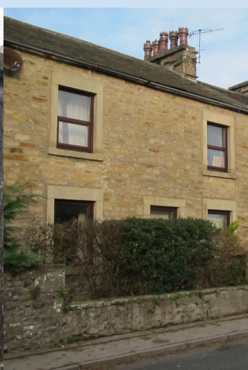
Fig. 31 Some traditional sliding sash windows have been replaced with unsympathetic modern mock-sash casement opening windows.

The buildings have been well maintained due to their continued occupancy and none of the designated or undesignated heritage assets are 'at risk' from deterioration. Traditional architectural features, such as doors, windows and roof coverings, have generally been well retained. Even so, there has still been some loss to the original historic fabric of a select few buildings that endanger the area's special architectural interest, such as the replacement of traditional windows with modern unsympathetic alternatives. To ensure that the area remains in a good condition and is enhanced, owners and developers should be made aware of conservation issues such as appropriate repairs, alterations and the importance of a heritage asset's setting.