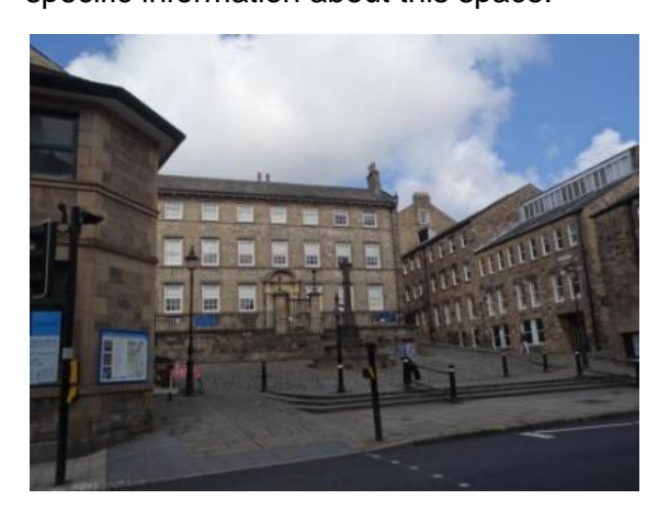
Public space in front of the Judges' Lodgings

gateway location (see above). The space today is well preserved and has strong character. The setted and paved surfaces enhance the setting of the Judges' Lodgings and the siting of the Covell Cross provides a centrepiece which allows the space to be seen on views down the lanes from Castle Hill. The space benefits from the boundary treatment and wall to the Judges' Lodgings, the stone steps and adjacent historic buildings to the north and south, which have been sensitively adapted and provided strong continuity and enclosure. Heritage-style street furniture has been installed and painted black. These are generally sensitive additions, despite the presence of a large number of bollards. There is a new interpretation sign sensitively located on an adjacent building, but this does not provide specific information about this space.