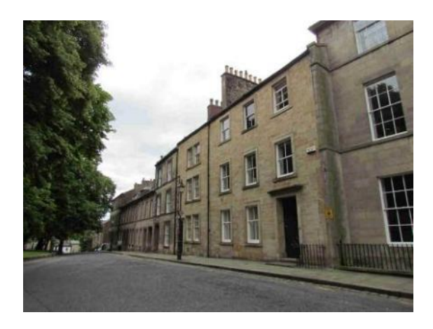
Georgian town houses, Castle Park

some houses have steps up to their entrances, with iron railings. The rooflines vary depending on the topography and building uses; houses on Castle Park have a uniform scale with horizontal eaves, but on Castle Hill buildings step up the hill, punctuated by gabled warehouses.