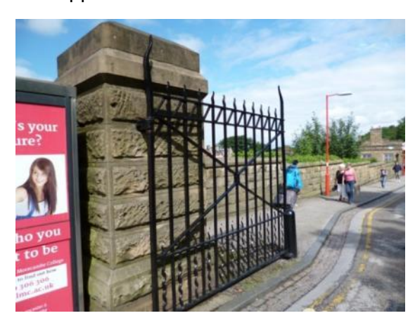
East entrance to railway station

On Meeting House Lane the public realm often consists of the standard concrete flags and kerbs to footways and standard lighting columns. However, this footway is enhanced by the stone retaining walls that line the back of the pavement and by surviving historic boundary features such as iron gates, railings, stone walls and gate piers. Stone gate piers and iron gates frame the important east approach to the station.