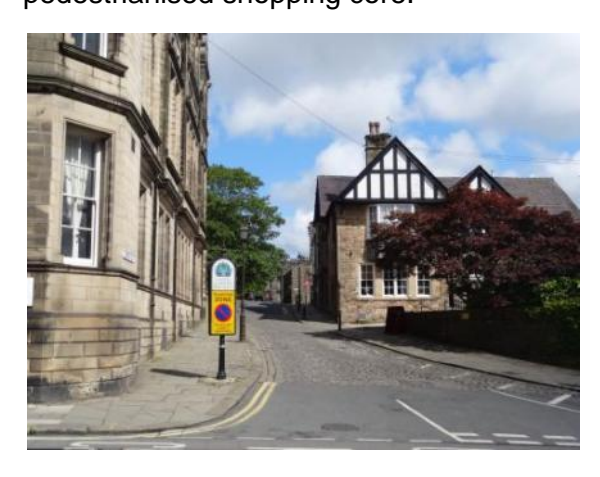
Route to the Castle precinct from Meeting House Lane

There are two significant nodes in this area. The visitor arriving at the train station enters the City Centre via Meeting House Lane. The junction of Meeting House Lane and Fenton Street effectively marks the moment of arrival. This is well defined by the striking presence of the Storey Institute. The access northwards to Castle Hill from here increases the importance of this node, acting also as a gateway to the Castle precinct. East of here the crossroads with Market Street and China Street marks the gateway to the pedestrianised shopping core.