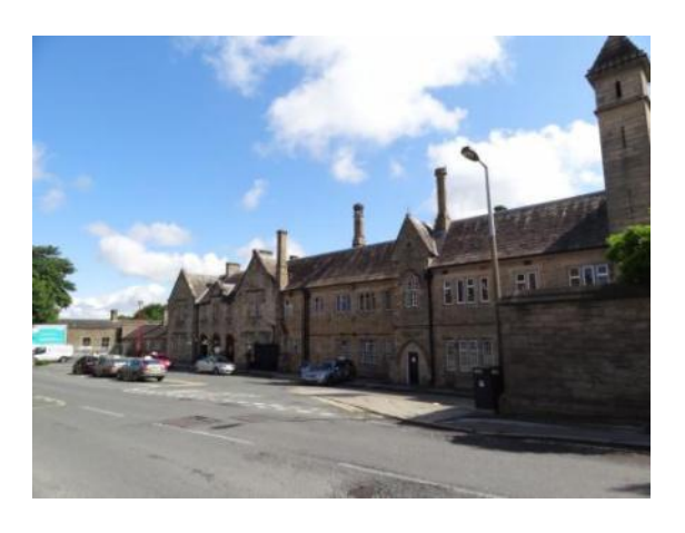
Railway station, built 1844

The railway station is also within this area, at the western end of Meeting House Lane, with the north-south railway cutting marking the western edge of the character area. The location of the station results in a significant amount of footfall on Meeting House Lane, as people travel between the Station and the City Centre.