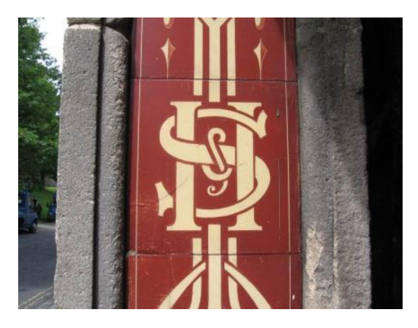
Tiling at Shrigley & Hunt's stained glass premises, 23 Castle Hill

Changing uses are reflected in some distinctive details; the Shrigley & Hunt premises at No. 23 Castle Hill have tiling to the entrance incorporating the letters S & H and dormer windows to the roof. Some former warehouses retain gables and full-height loading slots but new uses have introduced large areas of glazing to loading slots. Glazed doors were inserted at the former Gillow premises, as part of restoration after a fire in 1985. On Meeting House Lane, the Storey Institute was built for educational purposes but has recently been successfully refurbished as a centre for creative industries.