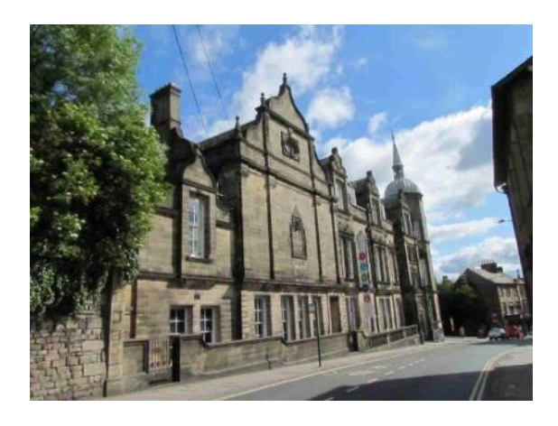
Storey Institute, 1887-91

High status buildings such as the Castle, St Mary's Church and the Storey are large scale, designed to stand out above the prevailing low rise of the city. Some alleys provide access to the rear of former burgage plots and allow glimpses of the much plainer rear of some properties. The Storey Gardens lie behind walls off Meeting House Lane with access from Castle Park through a portico moved from Fenton Cawthorne House (1770) on Meeting House Lane, after it was demolished in 1921. The intact medieval street layout and hilly topography provides framed views of buildings, and the green spaces of the Castle precinct provide a fine