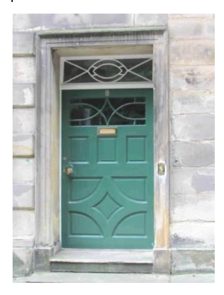
Timber panelled door and transom light

which should be preserved as far as possible.