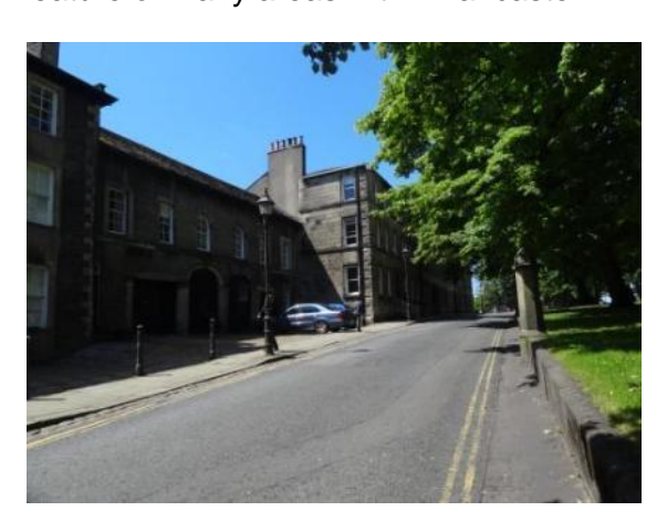
Public realm on Castle Park

without front boundaries, but overhanging lamps and trade signs create interest and add character to the streetscene. The streets around the Castle have been discussed above; they generally have appropriate surface treatments, although the carriageways are mainly plain tarmacadam. On-street parking can appear rather haphazard and sometimes detracts from the streetscene. Natural stone flagged footways are prevalent and cobbled forecourts are a distinctive local detail and an attractive feature of many areas within Lancaster.