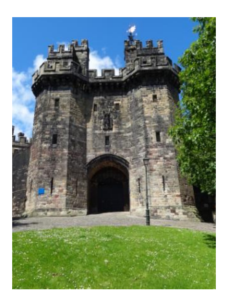
The Castle gatehouse, c1400

This character area contains the area of the Roman fort, occupied and rebuilt from the end of the 1<sup>st</sup> century AD until the 5<sup>th</sup> century; the east gate of the fort, in the area of the Judges Lodgings, led to the main road through the Roman town, aligned with Church Street. The abandoned fort was chosen as the location for the city's two key historic buildings: the Castle and the Priory. An early Christian community built the first church, probably in the 7<sup>th</sup> century; the Priory was founded in 1094. Around the same time, the castle was built, on the bluff overlooking the river. This developed into an important strategic base during the medieval period; the keep is largely 12<sup>th</sup> century and the imposing gatehouse dates from c.1400, built by Henry IV. The Assizes courts were held in the medieval hall and most of the Castle used as a prison. The Priory Church was largely rebuilt after 1431 when it was taken over by the Convent of Syon; most the current building is late 14<sup>th</sup> or 15<sup>th</sup> century. After the Dissolution, the building became a Parish Church. The open area overlying the north side of the fort was never built on, but Speed's map of 1610 shows the medieval layout of Castle and Priory, with houses lining China Street and Church Street.