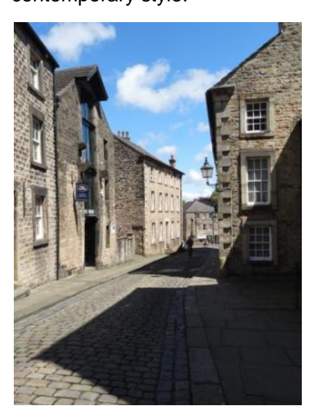
18th Century houses and a warehouse, Castle Hill

continuous frontages, but of individual design. Later examples are quite austere, with earlier 18<sup>th</sup> century houses more richly decorated. Paneled doors and sliding sash windows are set in moulded stone architraves, with raised quoins and moulded cornices to the eaves. Early 19th century terraced houses are generally plainer, often without window architraves. There are also some simple mid-18<sup>th</sup> century two-storey vernacular cottages, one of which is now a museum. The 19<sup>th</sup> century brought a variety of revival styles; the former vicarage built in 1848 is in Elizabethan style. Paley, Austen & Paley's Storey Institute is Neo-Jacobean with shaped gables and a corner turret. The several phases of the railway station are Elizabethan-style with the letters 'LC' in cartouches, mullioned windows, gables and tall chimneys. 20<sup>th</sup> century development uses a variety of styles and materials; the new vicarage behind the Priory is in a contemporary style.