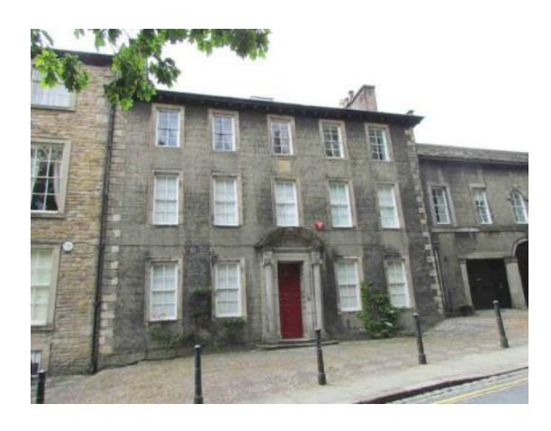
20 Castle Park, built 1720 for the Birdsworth family

Architectural details relate to particular periods of architecture: Georgian domestic buildings are distinguished by moulded window and door surrounds, sliding sash windows, panelled timber doors with fanlights and pediments, eaves cornices, quoins, and gable end chimney stacks. During the 19<sup>th</sup> century, some small-paned Georgian sashes were replaced with plate glass sashes. Later 19<sup>th</sup> century buildings feature more elaborate details taken from pre-Georgian design; hoodmoulds, gables with finials, strapwork panels, oriels, turrets and bay windows. Warehouses are characterised by strong vertical emphasis, with functional loading slots and gabled canopies. Most buildings have a variety of cast-iron rainwater goods