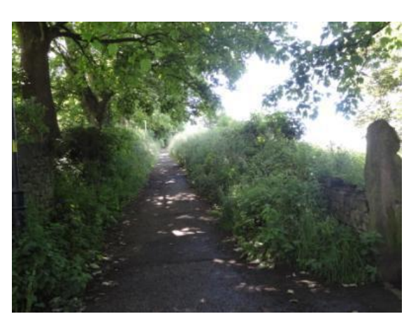
Pedestrian route by Quay Meadow