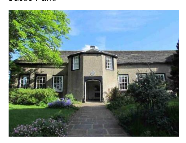
Friends Meeting House, 17<sup>th</sup> and 18<sup>th</sup> century

Building materials in this area are almost entirely of local sandstone; 18<sup>th</sup> century buildings are generally faced with ashlar to the front, although rubble stone is used for rear elevations. The Well Tower of the castle contains significant amounts of red sandstone. Local stone slate roofs have survived occasionally and these should be preserved, most roofs are laid with Cumbrian slates in diminishing courses. A few buildings are finished with a rough cast render, a vernacular material, including the Friends Meeting House which retains a stone slate roof, and the coach house next to 20 Castle Park.