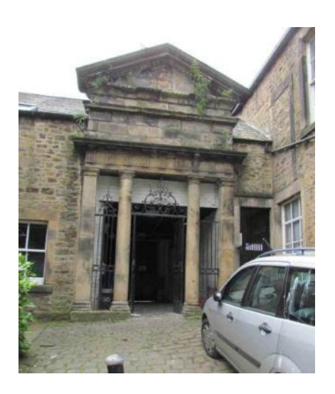
18<sup>th</sup> century portico to Storey Gardens, re-built here in 1921

setting for the Castle and the Georgian houses of Castle Park.