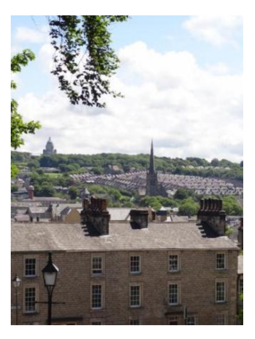
View east from Castle Hill

"The Castle area, dominated by Castle and Priory church, represents the historic heart of historic Lancaster. It is rich in the archaeology of the Roman and early medieval settlement and the architecture of the medieval and Georgian periods. Today the area retains important religious, civic and cultural functions, maintaining its symbolic role. The dramatic topography of this area reinforces this importance, creating views to and from Castle Hill which define character through central Lancaster."