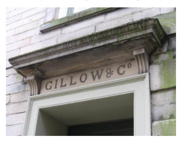
Gillow & Co.'s premises, 1 Castle Hill, built 1770

male prison were added, both designed by Thomas Harrison. A new Crown Court and Shire Hall were built at the end of the 18<sup>th</sup> century, also designed by Harrison in neo-Gothic style, creating an imposing complex.