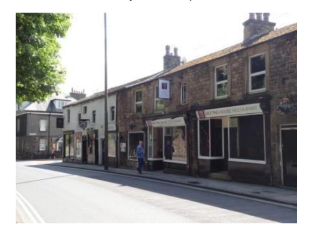
Retail units on the southern side of Meeting House Lane

retaining wall preserves the street enclosure whilst views into the grounds of the Friend's Meeting House, and the location of the Storey Gardens, present interest and a sense of discovery to the space behind.