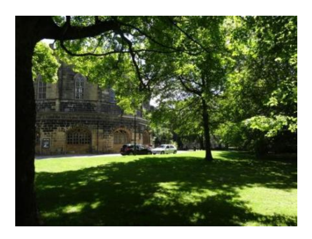
Castle precinct; view of the Courts

The character of the space itself varies; there is a more formal setting to the east and south of the Castle, where the grounds front a traditional street setting and benefit from the surrounding Georgian frontages. The setting to the west of the Castle becomes more informal as the topography results in a less continuous built form. The land around the Castle benefits strongly from long range views. These open up at key points as the character changes, most notably to the east of the Castle from St Mary's Parade.