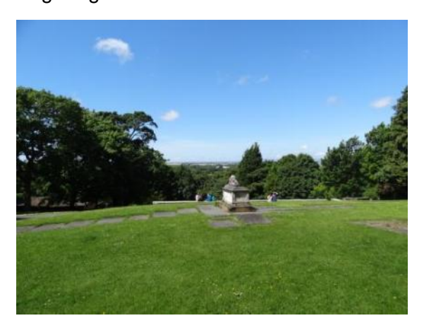
Open space to the west of the Priory

The Priory has its own distinct setting. This includes the more formal grounds directly adjoining the church and a semi-formal space to the west which takes advantages of strong long range views to the north and west. The formal setting includes stone flags and improves the setting, but elsewhere the floorscape here, and on paths to the west of the church, it is a standard tarmacadam and could be improved. The informal space to the west of the Priory benefits from some retained historic street furniture and features. including the remains of a memorial. There is also some new signage. This space also has several benches and is well used and enjoyed by people taking advantage of the long range views.