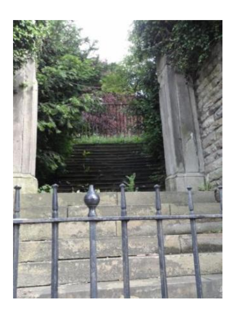
Historic features on Meeting House Lane

The lanes leading up to the Castle precinct have stone flags and cobbles or setts and are sensitive to their setting. The Georgian buildings here directly front the lanes tightly