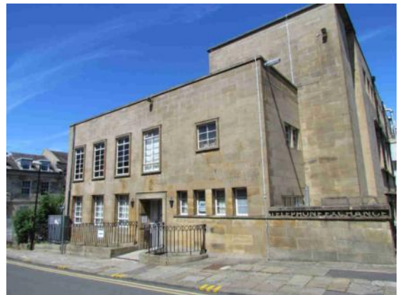
Telephone Exchange, 1952

The style of the schools varies, depending on their date. The former National girls' school is a long, low building in a severe Georgian