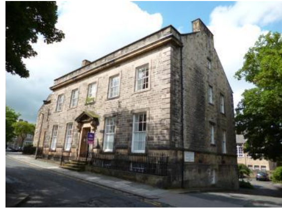
Highmount House, High Street, built 1774 (former offices of landscape architect Thomas H. Mawson)

The predominant character and architectural style of the area is Georgian. 18 th century town houses are two or three storeys high and up to five bays in width, most built up to the back of the pavement. Some are quite austere, and others more elaborately decorated with moulded door surrounds with pediments, cornices and parapets. Panelled doors with over-lights and sliding sash windows are set in moulded stone architraves, with moulded eaves cornices, raised quoins and large stone chimneys. Early 19 th century terraced houses are usually plainer, often without window architraves; the houses on the north side of Middle Street, houses on the north side of Fenton Street, 21 – 29 Queen Street and 1 - 9 High Street are typical examples of this later Georgian style. The doorways of 1 - 9 High Street have deep plain reveals under a simple cornice and the sliding sash windows at No. 9 all appear to be original.