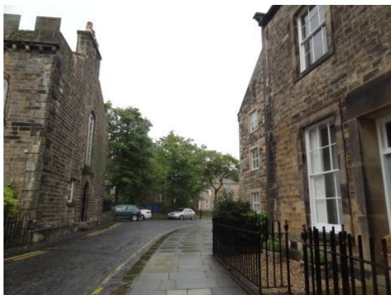
Public realm on High Street

The public realm in the area comprises strong street environments, which are an important positive element in the character of the area. The pavements are typically laid with stone flags, and cobbles also survive on a few minor access roads. Buildings generally front the back-of-pavement, their interesting stone frontages adding character and framing the street. Sometimes there are steps up to an upper ground floor entrance with an undercroft level below. Some buildings are set back (typically 1 metre or less) behind attractive iron railings. Other buildings sit within their own plots. In these cases planting often contributes positively to the streetscene (especially on High Street and Queen Street). In a number of instances (Queen Street bungalows or Trinity United Reform Church) these grounds are particularly attractive spaces and glimpsed views into them add considerable interest to the streetscene. At Trinity URC this view is framed by a Georgian wrought-iron arch with a hanging lantern.