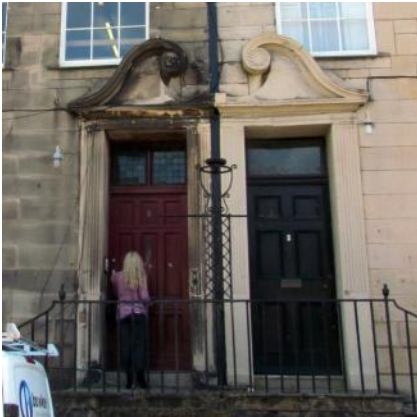
Georgian entrances and ironwork at 5 & 7 Queen Street

There are also fine examples of houses on Queen Street, such as the pair at 5 and 7, which have paired doors with fluted architraves beneath a scrolled pediment. The historic ironwork on the front steps also survives. The house at Number 1 has an over light and a portico entrance; this is now a doctor's surgery.