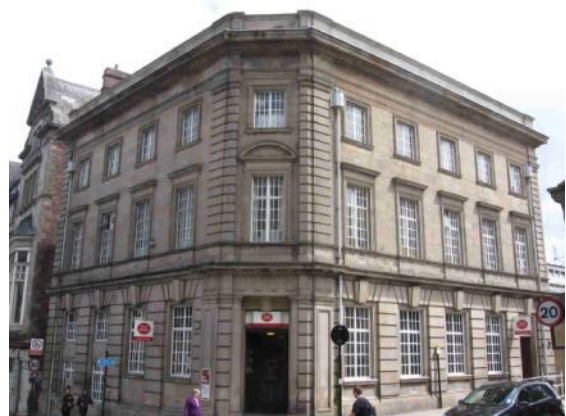
Post Office by Wilkinson, 1920s