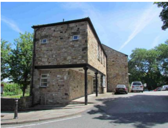
Former industrial building, High Street, 1880s

There are few industrial buildings left in the area; a linear stone building between 22 and 24 Queen Street was a malthouse in the late 19 th century, and is now a wholesalers. A building the east side of High Street was associated with a former timber yard, shown on the 1892 map; this stone building has cast-iron columns and beams to one side, and is now in residential use. Between Queen Street and King Street, sections of historic boundary walls are evidence of the steam-powered saw mills that replaced Henry Street Cotton mill before 1893.