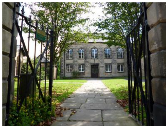
Attractive views into plots from the street.