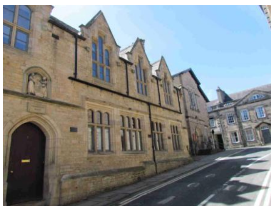
Former Bluecoat School, 1849-50