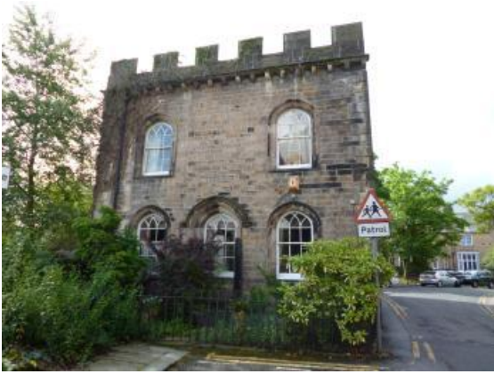
High Street Cottage, Gothic style

The 1770s Trinity United Reformed Church has a symmetrical frontage with arched windows, glimpsed across a grassed forecourt from High Street.