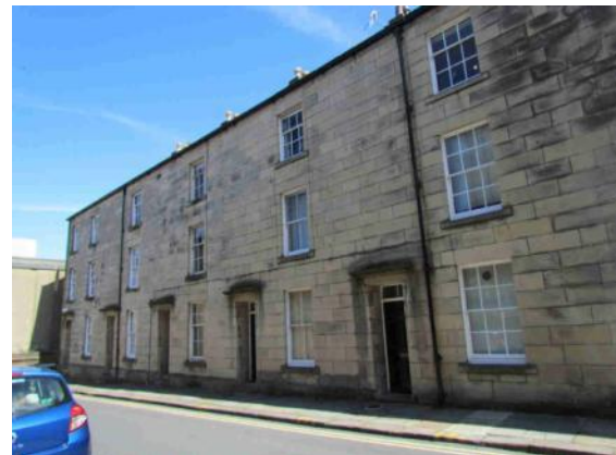
1-9 High St