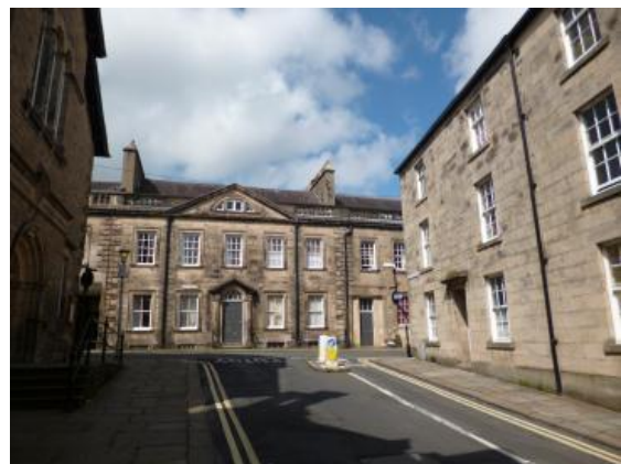
No 4 High Street, from Middle Street, built c.1775

Most of the 18 th century buildings, t, were built as private houses for the middle classes. High Street retains a rich collection of fine Georgian houses, with a formal ensemble of three houses facing Middle Street, all built c.1775. The central house, No. 4, was built for John Rawlinson, and has a pedimented central block with doorway framed by Doric columns. The houses either side have carriage entrances and the whole block has a balustraded parapet.