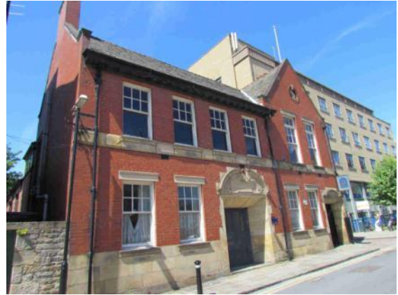
2 Fenton Street

Charles Wilkinson in Baroque Revival style. Behind the Post Office is a group of telephone exchange buildings which contribute to the character of the street; the 1952 building is designed in an austere, blocky classical style and faced in ashlar.