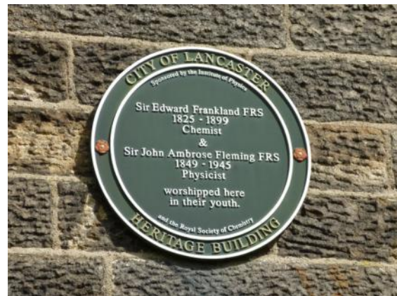
Plaque recording notable scientists, United Reformed Church, High Street

Court, a block of flats was built west of High Street, with new development on the east side of Queen Street. In the south of the area, Armstrong-Siddeley used Queen's Mill for making aircraft components during the war; the mill was demolished in the late 20 th century, and the site redeveloped for retail development, which has eroded the historic character of this part of the area.