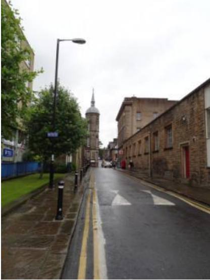
The street layout creates vistas to prominent buildings.

The character area directly fronts the Lancaster Canal to the south edge. The new apartment blocks facing the canal follow the approximate massing of historical industrial buildings that once stood here. This form is appropriate and provides good enclosure and overlooking to the canal-side, which lies at a lower level behind a retaining wall on the opposite side of Aldcliffe Road. The active and articulated frontages of these blocks provide interest to this frontage. Further west the B&Q store is set back from the canal edge, behind new apartment blocks that lie outside of the conservation area. The siting of the retail warehouse pays no regard to the canal-side but the boundary treatment, consisting of a low stone wall and some planting in places, does help the building relate to the surrounding environment.