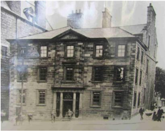
Fenton Cawthorne House, demolished in c.1920 to make way for the Post Office

Spinners Court, a 1990s block of flats was built over Ann and Britannia Streets, and more recently, apartments have been built on the former Arla Foods depot in the Aldcliffe Road/Henry Street area, on part of a Roman cemetery,