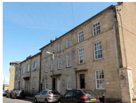
Early 19 th century houses at 21-29 Queen Street

Other buildings are in a variety of styles according to their date. In contrast to the controlled Classical Georgian of the larger houses, the Cottage is an unusual example of late 18 th century Gothick, with arched windows, inter-laced glazing bars and a castellated parapet.