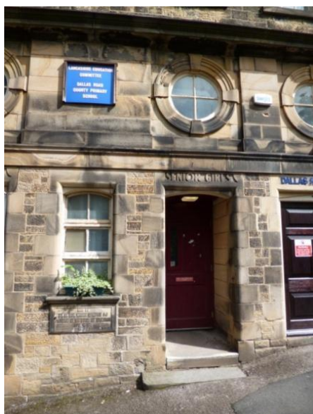
Dallas Road School entrances

In response to the topography of the area, some houses have steps up to their entrances, with iron railings. The roofline varies depending on the topography and building uses; houses on the main streets have a fairly uniform scale with horizontal eaves. Historic plots with narrow frontages are still a feature on High Street and Queen Street, but in the west part of the area, on the slopes below High Street, later development was built to a different pattern and density, with community buildings such as the schools set in larger plots. The scale and massing of these buildings is also larger than the domestic buildings.