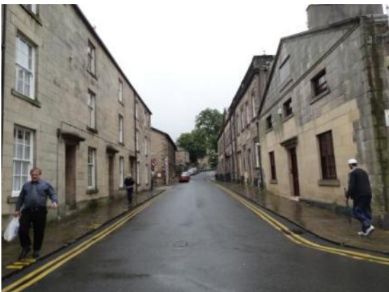
Long street views are a local feature

Topography plays an important role in the character of this area. Land generally falls gently southwards toward the Canal, but High Street also runs along a low ridge, approached from the east by a steep rise up Middle Street. The high point is located around the Georgian Gothick-style building on High Street from where the land falls, often steeply, to the east and west. This is handled with changing ground levels within terraces. The enclosure of relatively narrow streets with tall development (generally three storeys) means that long range views are rarely possible. The street layout has been used to create some important framed vistas to prominent buildings; particularly to 4 High Street from Middle Street and to the Storey Institute from Fenton Street.