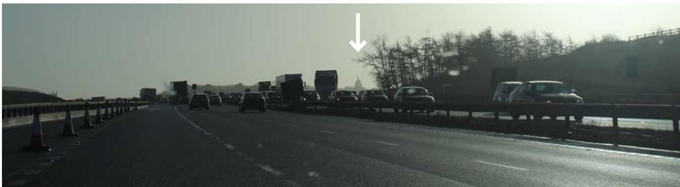
View from M6 Ashton Memorial is clearly visible on the skyline. (Photo taken at speed and in heavy traffic)

The redevelopment of Cuckoo Farm additionally provides an opportunity to screen less favorable views of the prison and therefore improve the setting of the Ashton Memorial visual corridor and relationship of the urban settlement in this rural fringe.