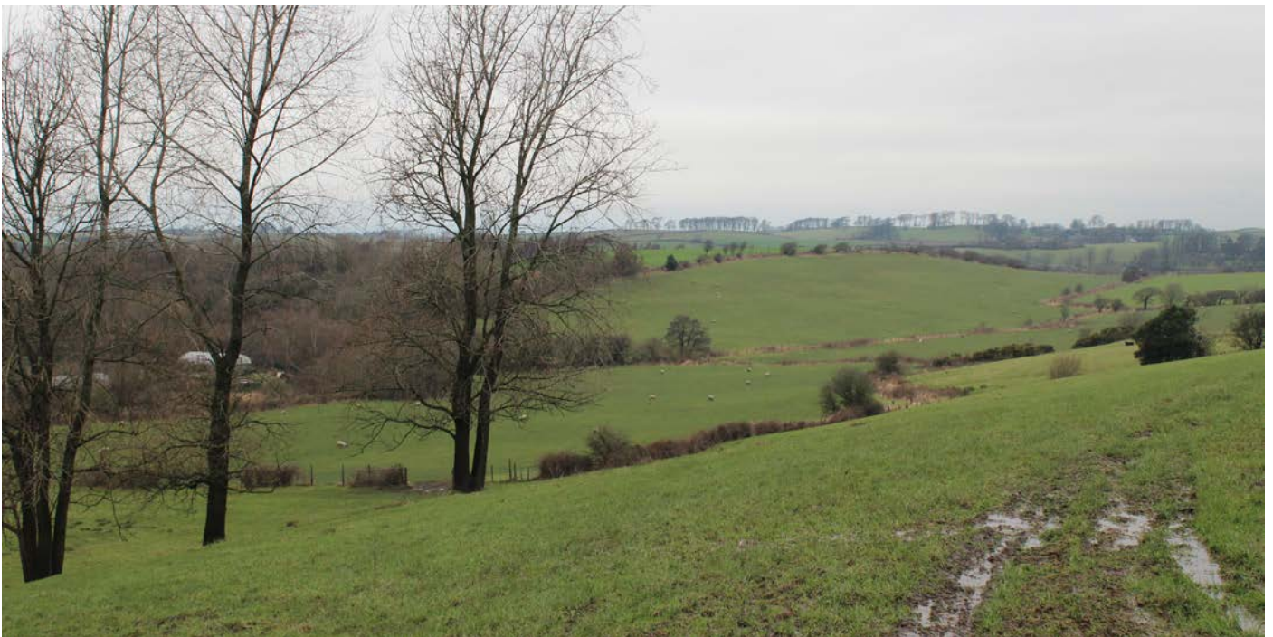
Rolling landscape and distant views

The central 'Ridge Wood' area is deliberately left open and undeveloped to reflect the current landscape character and respect the unbroken skyline. This high plateau has the potential to become a Country Park and capitalise upon open and expansive views across Lancaster from this elevated location. In turn, the central open space provides the opportunity to create a zone of Public Open Space for recreation and appreciating the wider landscape. The primary area proposed for development in UE3 is well screened by the undulating landform when viewed from the rural fringe of the M6, topography therefore plays a key roll in absorbing development within the lower enclosed drumlin valleys.