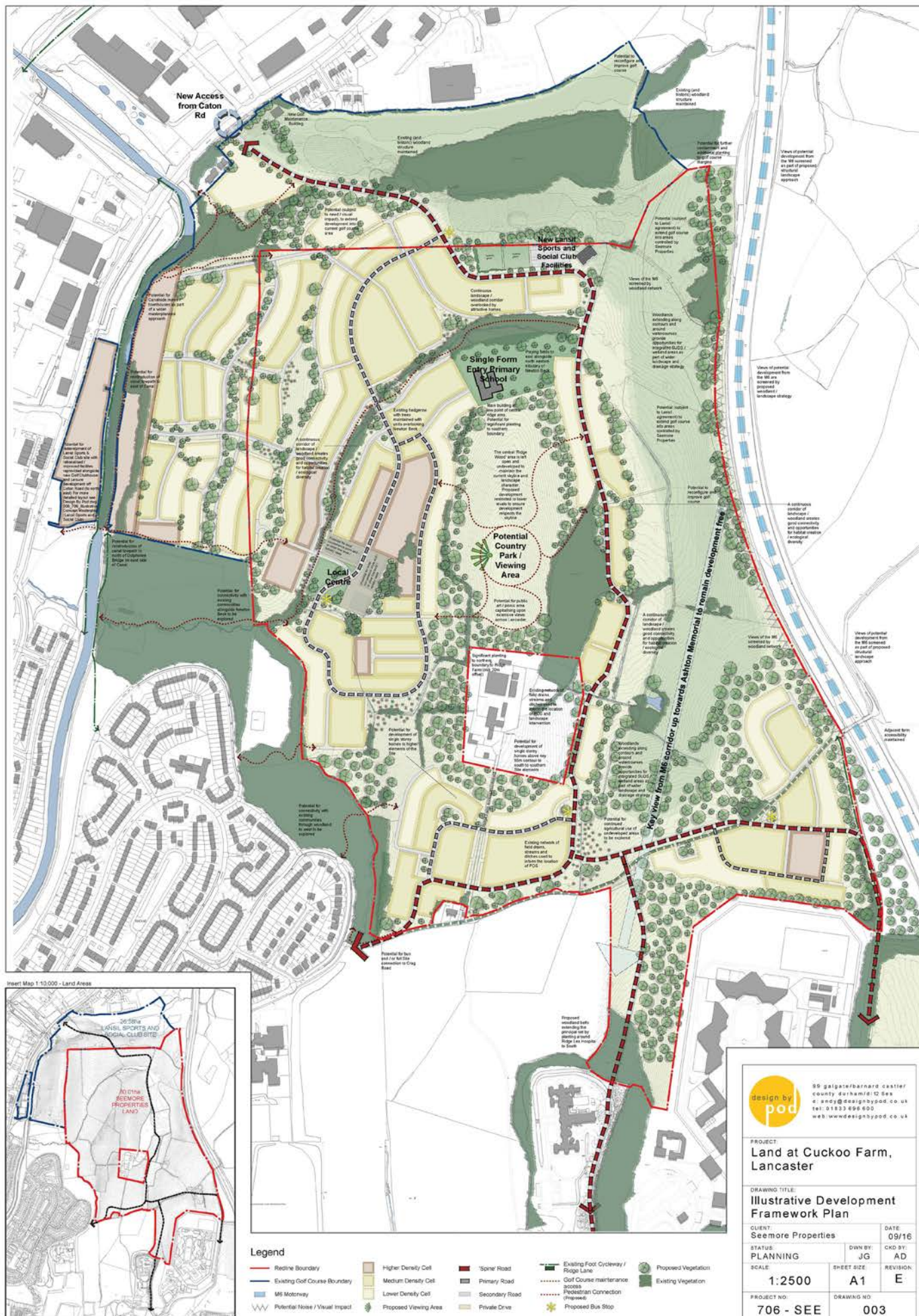
Figure 2 Illustrative Development Framework Plan, Rev E